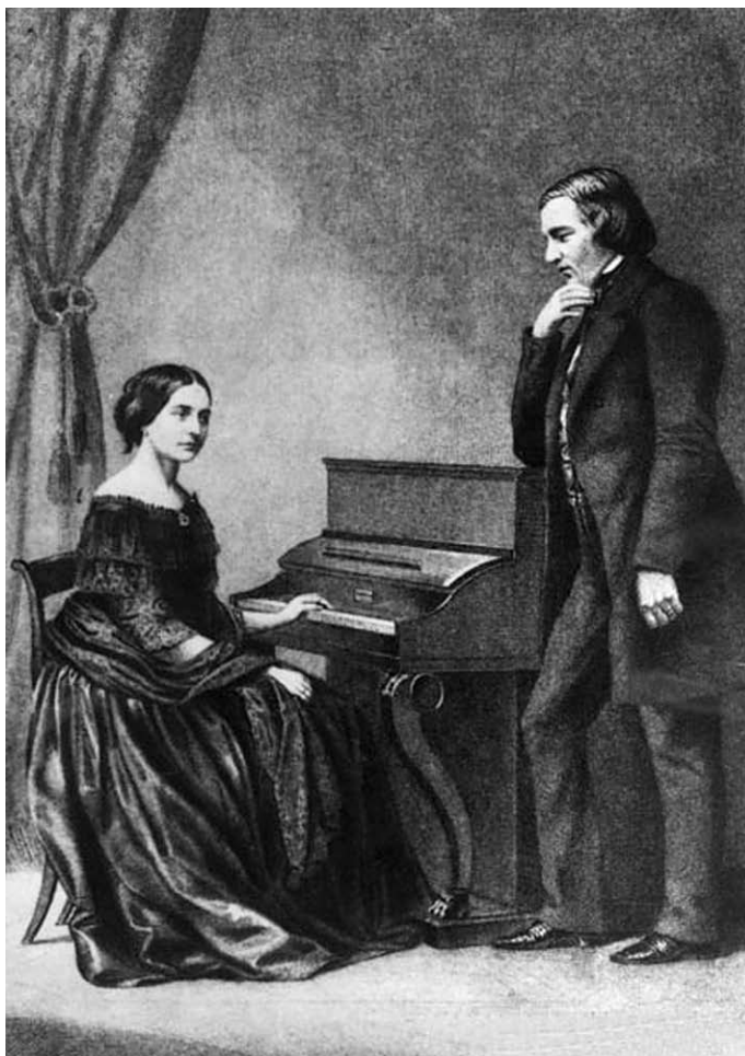
Robert and Clara Schumann joined the cultural renaissance of Mendelssohns, Dirichlets, and Hensels, in 1835. After Robert’s untimely death in 1856, Clara—one of the most celebrated pianists of the 19th Century—continued to write, teach, and play music.

Mendelssohn, one year older than Schumann, moved to Leipzig in 1835, taking the post of the conductor of Leipzig Gewandhaus Orchestra. He opened