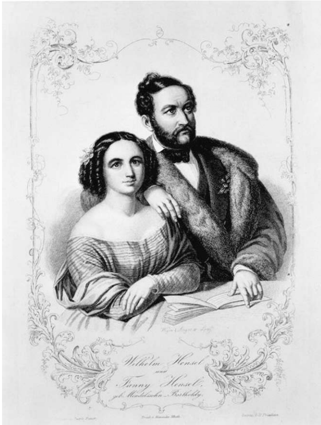
In 1829, Fanny married the painter Wilhelm Hensel, who did many paintings and drawings of the brilliant participants in Rebecca's musikabends.

ried the painter Wilhelm Hensel. They recommenced in 1831, becoming again the center of Berlin's cultural life. Fanny composed for many such events. From afar, Felix still sent his occasional contributions. Rebecca was the soprano for Fanny's lieder. Fanny's husband, Hensel, made paintings of many of the attendees—including Vincent Novello, Eduard and Theresa Devrient, Theodor Körner, Heinrich Heine, Jacob Grimm, Karl August Böckh, Robert and Clara Schumann, Leopold von Ranke, and Dirichlet's close colleague, Carl Jacobi.