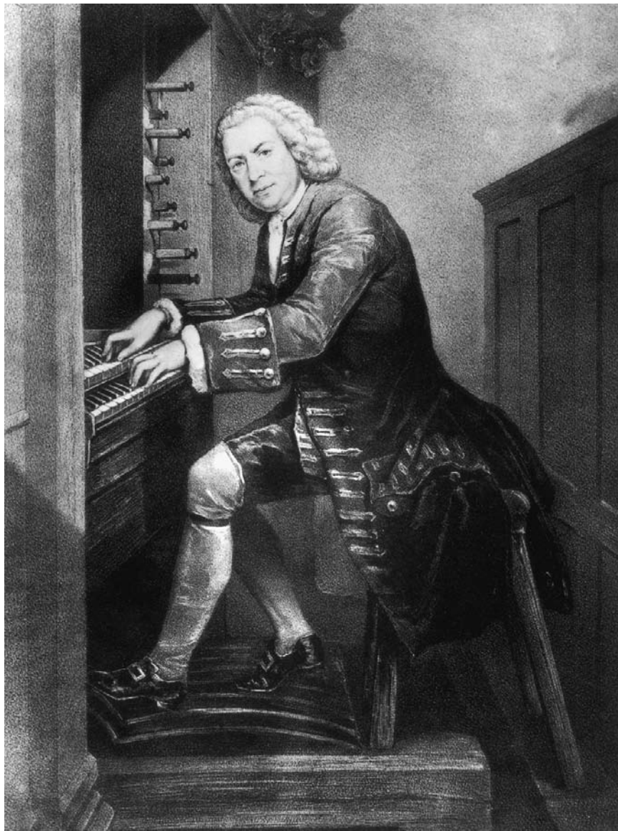
The Mendelssohn family revived the works of the great J.S. Bach (shown here at the organ), notably, the "St. Matthew Passion," which had not been performed for 100 years, and the "Chromatic Fantasy and Fugue," as the core of their music/science renaissance.

the 'Chromatic Fantasy and Fugue,' 'Bach wanted it thus,' 'Bach willed it so,' until one felt oneself in the presence of these great spirits... No one has ever given the 'Chromatic Fantasy' the same breadth and fullness of phrasing and brought out its glorious beauties as Clara Schumann did." 94