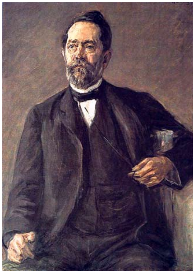
The mathematician Felix Klein described Rebecca's soirées as an "incessant choppy sea of dazzling intellects," which must have distracted Dirichlet from "pure mathematics."