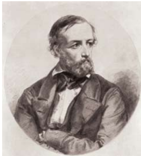
The young genius Lejeune Dirichlet (above), had been brought from Paris to Berlin, and introduced to the unique cultural life of the Mendelssohn family, by Alexander von Humboldt (right)—who, along with his brother, Wilhelm—had studied at the feet of Moses Mendelssohn in the 1780s.

The 1815 Congress of Vienna had transferred con-