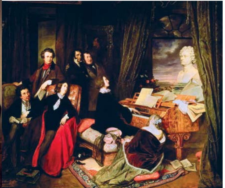
Clara Schumann described Franz Liszt's piano playing as "so abominable that I felt utterly ashamed at having to stay and listen." When Liszt impugned Mendelssohn's character, Schumann stormed out of the room. The painting shows Liszt "Fantasizing at the Piano" in a Paris salon. Inset: Liszt (portrait by Miklos Barabas, 1847).

attack Mendelssohn as not up to Meyerbeer's level. Possibly, Liszt was provoked by a memory of Mendelssohn's habit of parodying Liszt's performances, or possibly it was premeditated, so as to force Schumann's hand. Either way, the insult was not about a comparison to Meyerbeer. Liszt knew that claim could not be taken seriously. However, Meyerbeer and Mendelssohn were distant cousins, both being descended from the famous Rabbi Isserles of Samocz. Liszt was lumping them together, implying to Schumann that Jews are to be compared with Jews, and we non-Jews can resume our own activities. The normally taciturn Schumann rose from the back of the room: "Meyerbeer is a pigmy compared with Mendelssohn . . . an artist who has done great work not only for Leipzig but for the whole world, and you would do better to hold your tongue!" Schumann then stormed out. 63 Liszt first tried to shrug off the confron-