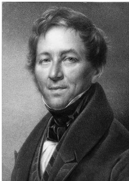
August Böckh, the great Classicist and philologist, was a regular at the musikabends, and a longtime family friend of the Mendelssohns. Among other instances of collaboration, he and Felix wrote the music for the 1841 staging of Aeschylus' "Antigone."

August Böckh, the great Classicist and philologist, and longtime family friend of the Mendelssohn, was a regular at the musikabends . He even took up residence in the Mendelssohn household from 1840 to 1846. Felix collaborated with Böckh in writing the music for the 1841 staging of Aeschylus' "Antigone" in Berlin—a performance that was probably facilitated by the newly opened railroad line connecting Leipzig and