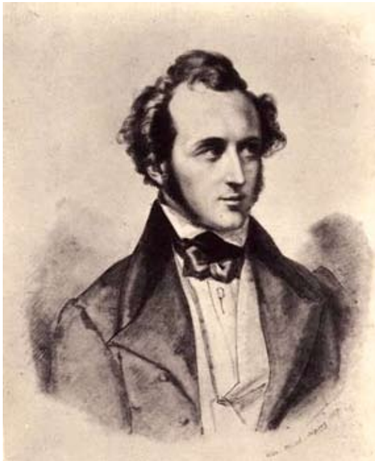
Between 1825 and 1827, Felix (left) and Fanny took on the personal mission of mastering Beethoven's late works. When Beethoven (right) died in 1827, the 18-year-old Felix composed his first string quartet (Op. 13). Portrait of Mendelssohn by Wilhelm Hensel (1837); portrait of Beethoven by Joseph Karl Stieler (1820).