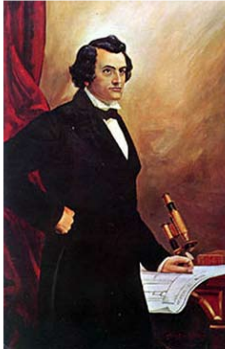
In his “Philosophical Fragments,” Riemann developed his concept of the “thought-mass”: “The soul is a compact thought-mass, bound together in the most intimate and most manifold way. It constantly grows by the introduction of thought-masses, and upon this rests its further development.”

Brahms had taken a measure of the depth of the disease, and didn’t look back.