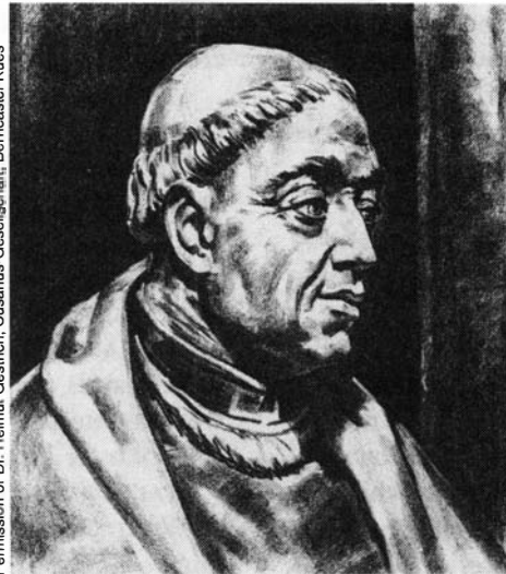
Cardinal Nicolaus of Cusa

The WORD responded: You will not find another faith, but rather one and the same single religion presupposed everywhere. You who are now present here, are called wise men by the sharers of your language, or at the very least philosophers or lovers of wisdom.