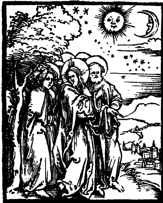
Albrecht Dürer, "Christ shows His disciples the signs in the heavens," 1503.

unfold the most fecund simplicity of essence better. Also notice that there is a certain fecundity in the essence of the rational soul, that is, mind, wisdom, and love or will, since the mind exerts intellect or wisdom from itself, and from both proceeds the will or love. And this trinity in the unity of essence of the soul is the fecundity, which man possesses in his similarity to the most fecund, uncreated Trinity. Likewise every created thing bears the image of creative power, and possesses fecundity in its manner in greater or more distant similarity to the most fecund Trinity, Creator of everything. It is therefore not so, that the creature has its being only from divine being,