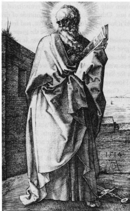
Albrecht Dürer, "St. Paul," 1514, second state.

PAUL: Very well stated. However, since no living being is justified in the sight of God on the basis of his works, but rather through grace, the Omnipotent gives to whomsoever He wishes, whatsoever He wishes. If therefore someone shall be worthy of obtaining the promise, which is issued out of pure grace, then it is necessary that he believe in God. In this therefore is he justified, since he obtains the promise only on the grounds that he believes in God, and expects that the Word of God be done.