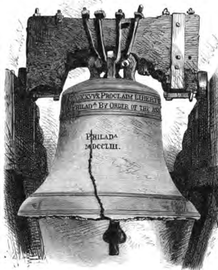
Liberty Bell, Philadelphia

In a July 1987 essay, "The U.S. Government Is in Chaos," Lyndon LaRouche drew the parallel between the crisis in Washington and developments of the French Revolution of 1789. LaRouche's purpose in making this comparison was to warn against following the economic policies of