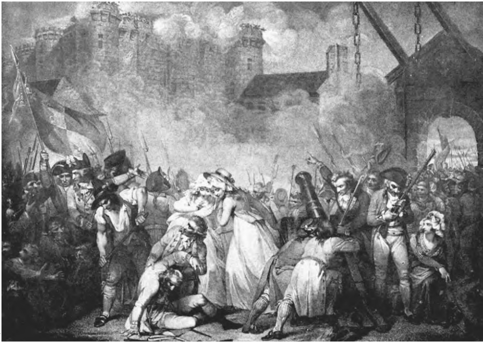
The fall of the Bastille, July 1789. Unchecked, the French Revolution degenerated into mob rule.

Beneficent is the might of flame, When o'er it man doth watch, doth tame, And what he buildeth, what he makes, For this the heav'nly powers he thanks; Yet fright'ning heaven's pow'r will be, When from its chains it doth break free, Embarking forth on its own track, Nature's daughter, free alack.