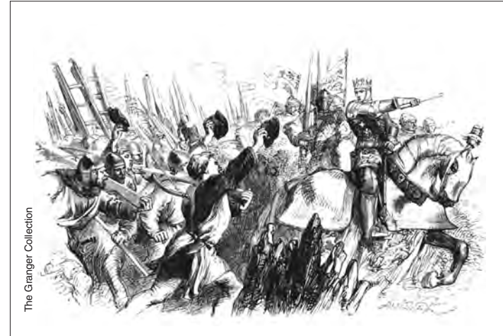
Scenes from "Henry V." Henry exhorts his troops to attack the city of Harfleur, at the start of his invasion of France, Act III.

A good prince has the obligation of looking to the welfare of his people even at the cost of his own life if need be.