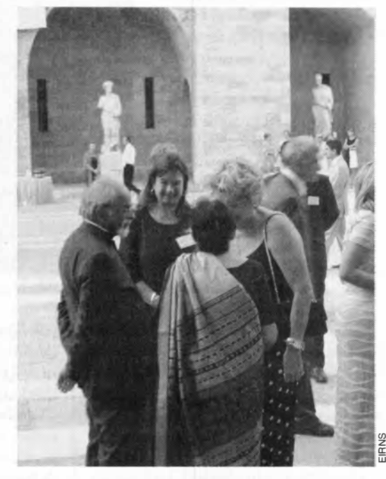
Helga Zepp LaRouche speaks to former Indian Prime Minister Inder Kumer Gujral and his wife at Rhodes.

Considering the great diversity in the speakers' points of view, and the wide spectrum of topics, the draft text of the "Declaration of Rhodes" managed to represent the spirit uniting all participants: a deep distrust of the current world order's scale of values, according to which the one side seeks to maintain a "consumer society by means of armed