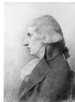
Attempts by reformers like Pushkin and Lermontov to influence the policies of Tsar Nicholas I (left), challenged the worst oligarchical elements of Imperial Russia, represented by Russian Minister of Foreign Affairs Count Karl Robert Nesselrode (center left). Nesselrode's views were shaped by the 1815 Congress of Vienna, and its Habsburg and British Empire spokesmen Prince Klemens Metternich (center right) and Viscount Castlereagh (right).