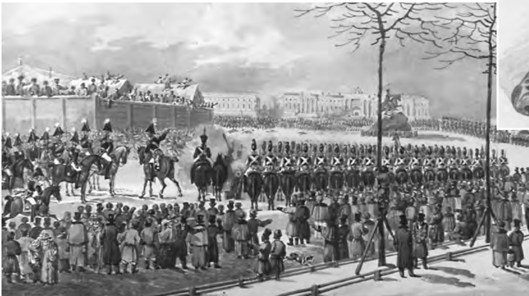
The Decembrist uprising, Senate Square, St. Petersburg, Dec. 14, 1825, was staged by young officers against the incoming Tsar Nicholas I. Right: Decembrist A.I. Odoevsky, watercolor by M. Lermontov, 1837.