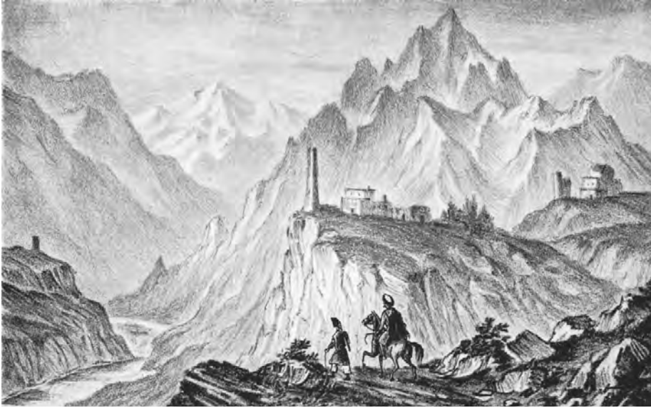
View of Mt. Kreshora from the gorge near Kobi, the Caucasus. Drawing by M. Lermontov.

ization and change after the defeat of Napoleon in 1815.