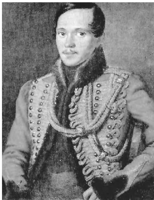
Mikhail Yurievich Lermontov