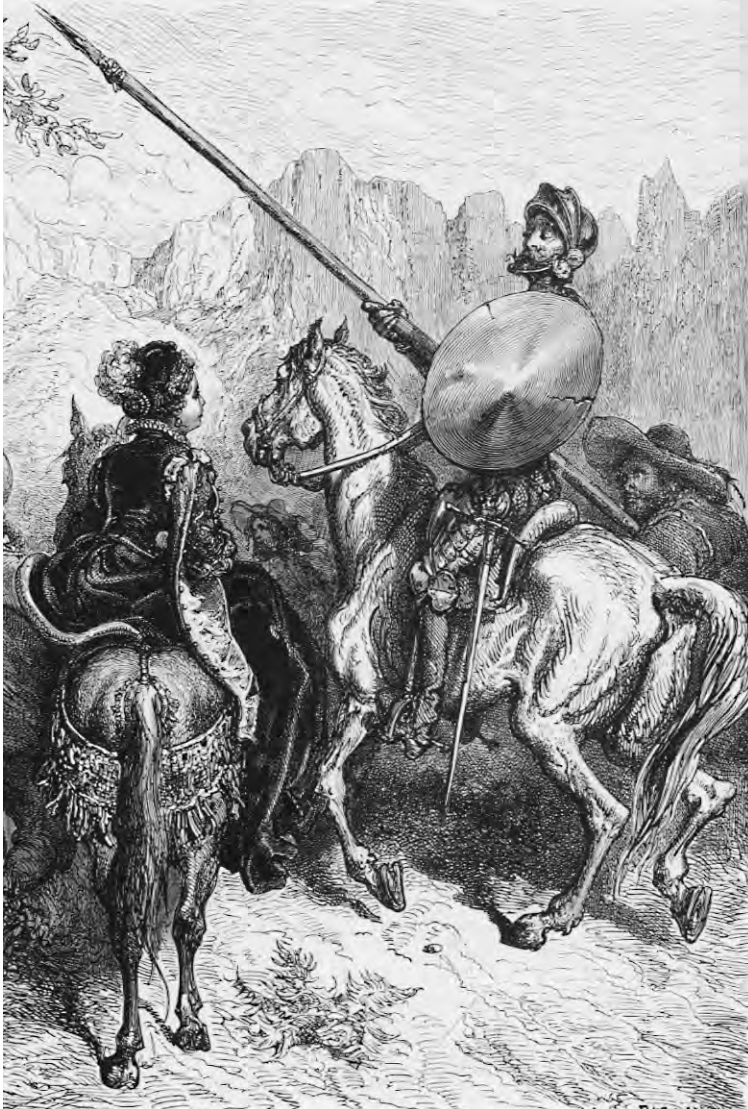
Don Quixote, accompanied by Sancho Panza, agrees to slay a giant for Dorotea (Part I, Chapter 29).

As most everyone knows, the basic plot of Don Quixote concerns the adventures a member of the lower landed gentry at the end of the Sixteenth century in Spain, who, having gone crazy from reading too many books of knight-errantry, decides to become a knight-errant himself, and, along with his neighbor, the peasant Sancho