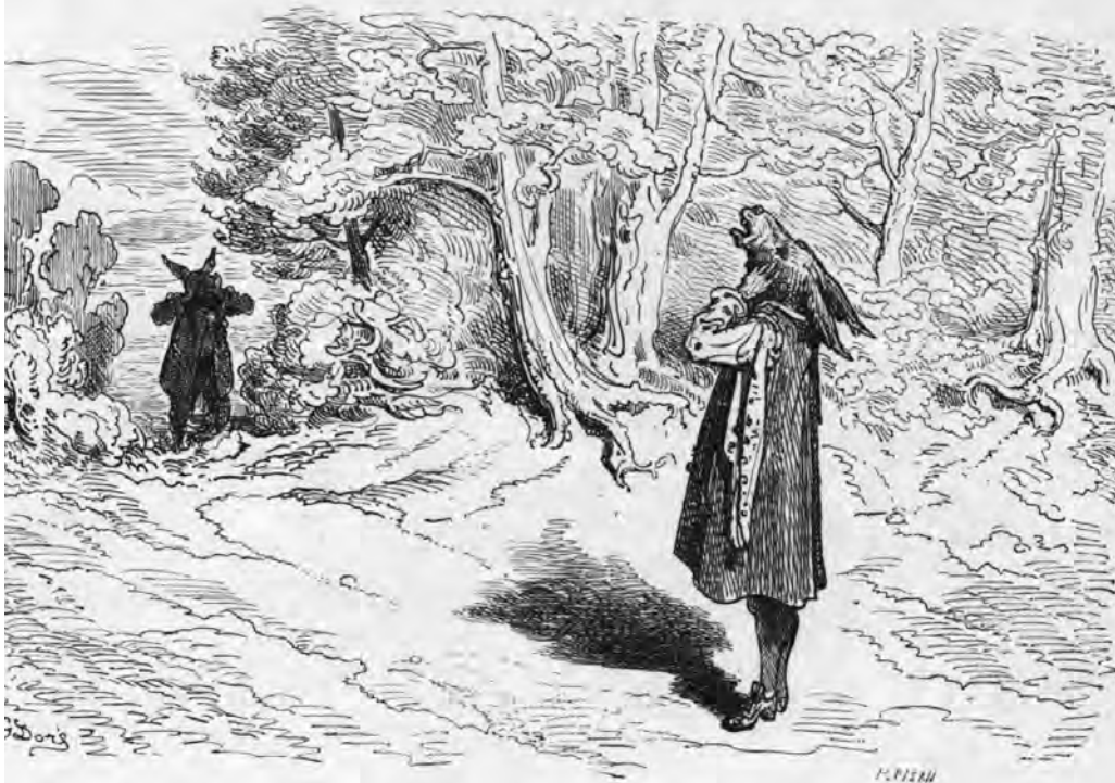
Prelude to the War of the Braying (Part II, Chapter 25).

“Some days ago I learnt of your misfortune, and the reason which moves you to take up arms in order to avenge yourselves on your enemies; and having pondered your affairs in my mind not once but many times, I find that, according to the laws of duelling, you are mistaken in regarding your-