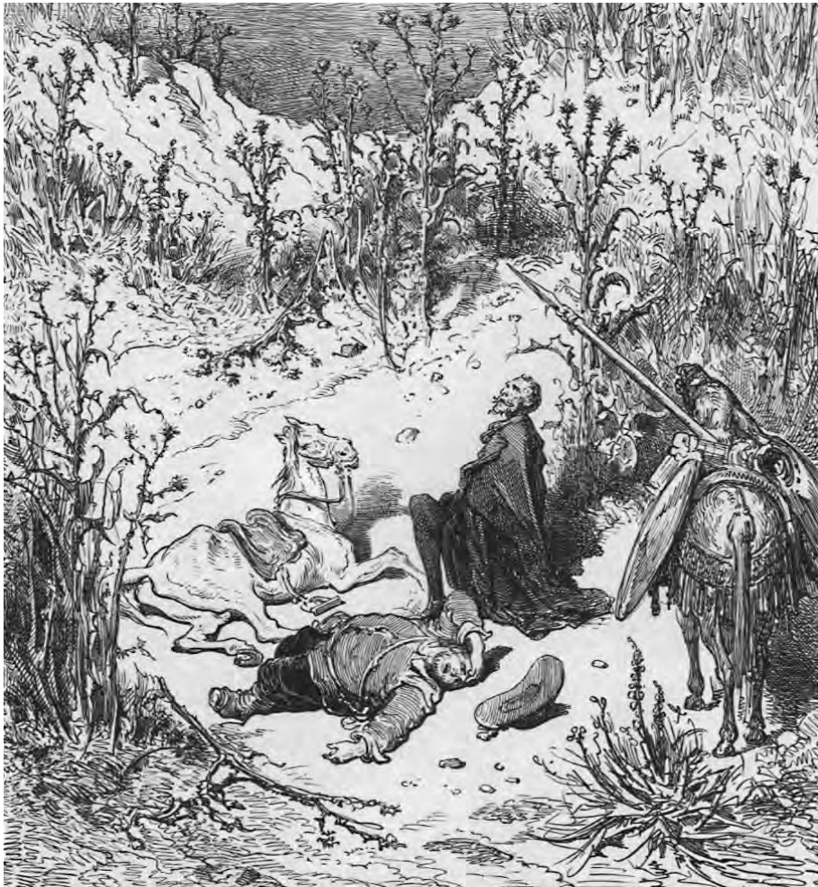
Don Quixote sings of love, life, and death (Part II, Chapter 68).

the village, that is, of other characters in the novel. Then, Sancho brings the news that a book has been published about their adventures, something that is true in the real world, as opposed to the fictional world of the village. We now have the story developing on two planes: the fictional village, and the real world, where there is indeed a book called Don Quixote , which you, the reader, have in your hands. Samson Carrasco comes on the scene and confirms that the author is a Moor, Cide Hamete Benengeli, who has written it in Arabic, and that it has been translated into Castilian by a Spanish Christian, so