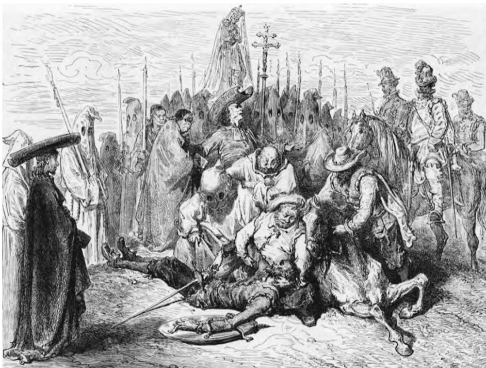
Don Quixote is beaten by flagellants after attempting to liberate the statue of the Virgin (Part I, Chapter 52).

The whole scene is hilarious, and Don Quixote’s confusing the penitents with kidnappers, brings to mind the famous incident where he confuses the windmills with giants. But, again, through the group’s discussion process,