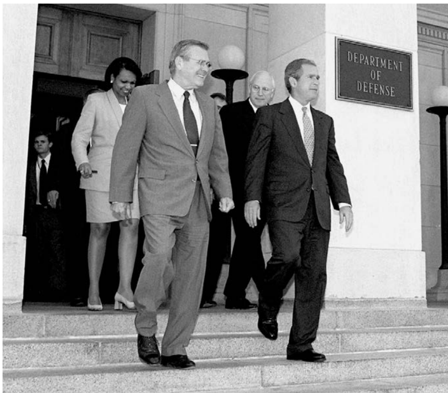
President George W. Bush with the "Vulcans": architects of the utopian drive for empire, National Security Adviser Condoleezza Rice, Defense Secretary Donald Rumsfeld, Vice-President Dick Cheney.