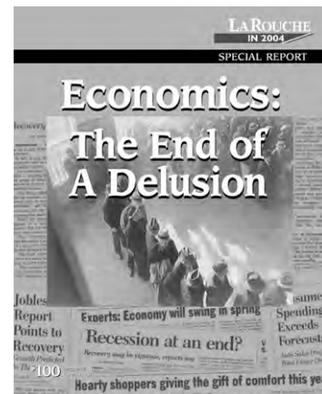
Economics: The End of a Delusion Washington, D.C., LaRouche in 2004, April 2002 136 pages, paperback

From October 1929 onward, the preceding decade’s wild debt speculation crashed the financial system down on top of an advanced and sturdy underlying economy—one which had grown beyond measure from the Civil War to 1900, and then gone through an in-depth industrial mobilization for World