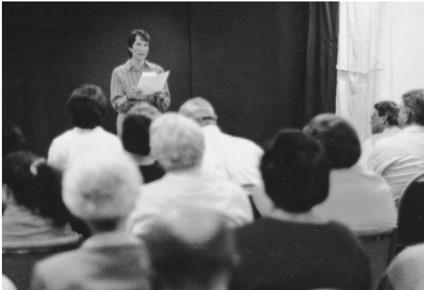
Poetry recitation, Schiller birthday-fest. "How do we reconcile the longing for joy in the beautiful, with the fleeting, temporal nature of everything in the physical universe?"

ty, transcending the physical, is constituted. This kind of love, which seeks this higher, eternal nature of Man, is what the Greeks called agapē , and its manifestation in art is the sublime .