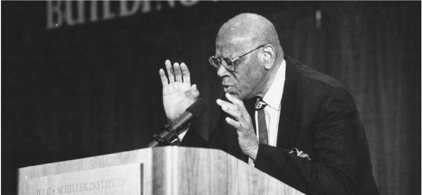
Dr. William Warfield, poetry recitation at Schiller Institute conference, January 1998.