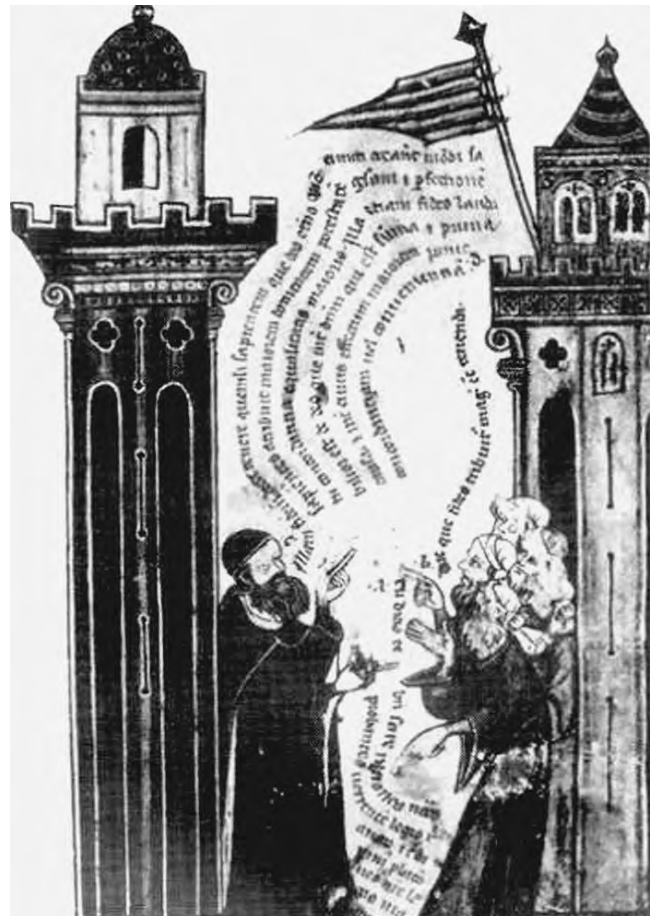
The Thirteenth-century Catalan philosopher Ramon Llull (1232-1315) established a dialogue based on reason between Christianity and Islam.

The greatest achievement in this regard, however, was Dante’s, and it came as a direct result of the work done in Seville and Palermo. In his De Vulgari Eloquentia , his seminal work on the vernaculars, Dante lamented the fact that there were other vernaculars superior to Italian; although he does not identify them, the only ones current