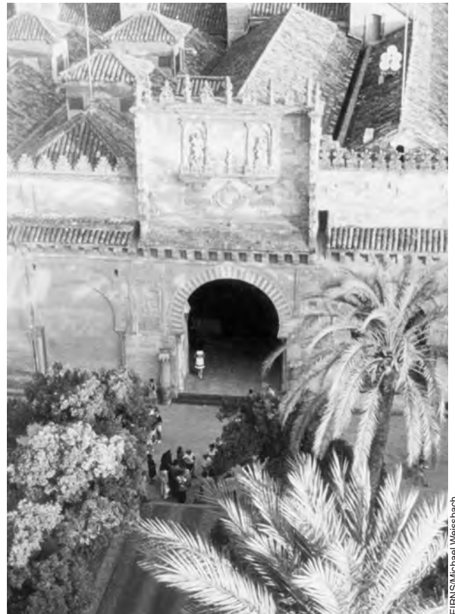
Entrance to the Great Mosque of Córdoba.

The Koran itself is considered by Muslims to be what one might call a unique experiment; although the validity of the ideas it contains is to be taken on faith and is susceptible to rigorous proof by Reason, yet an oft-cited test