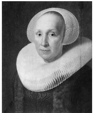
Reprinted from Rembrandt: The Painter at Work