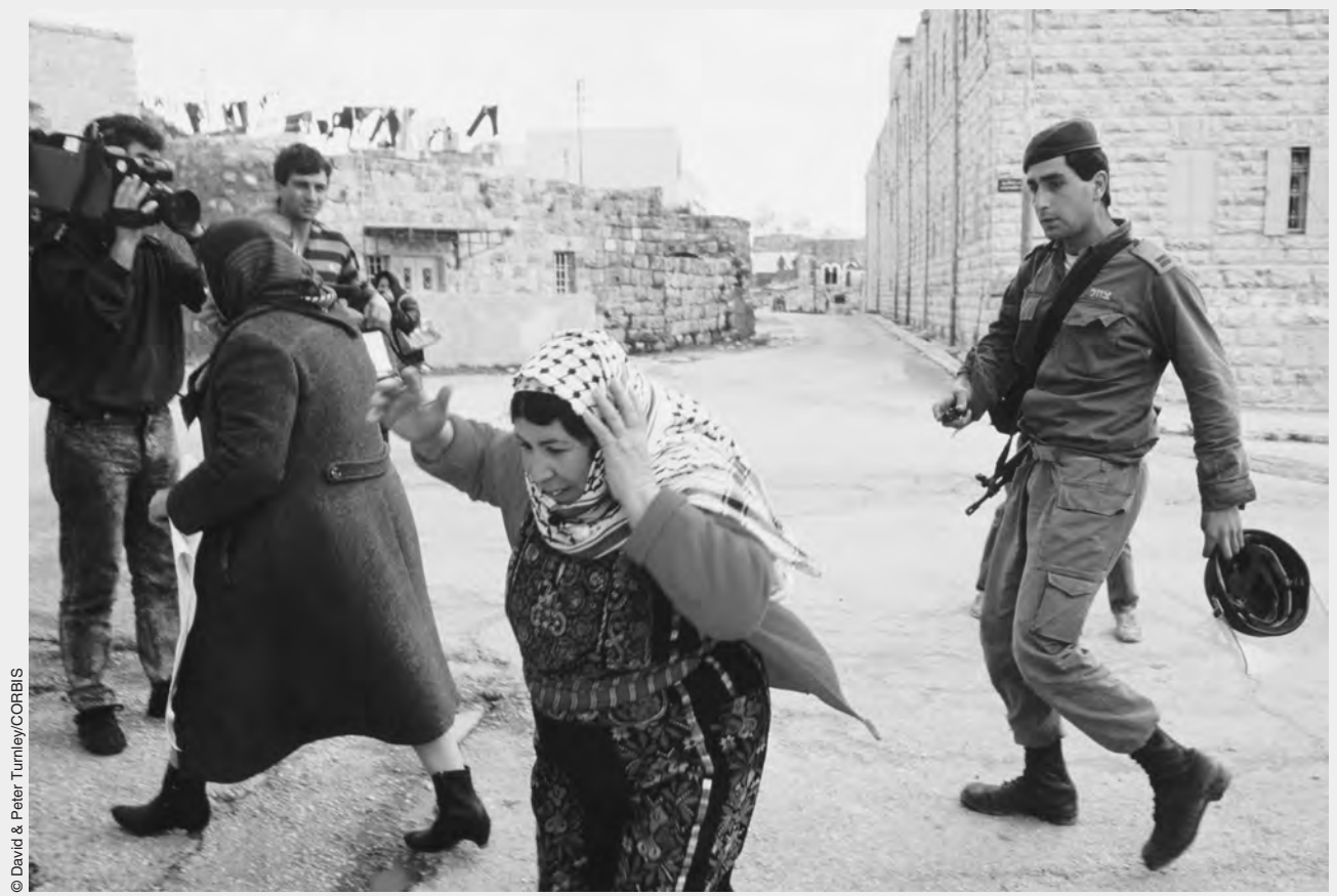
An Israeli soldier confronts Palestinian women in the West Bank, c. 1988.

The same use of orchestrated religious warfare, as organized by Venice from the Fourth Crusade through 1648, has today been unleashed in the aftermath of the collapse of the Soviet system. The world is now hovering at the brink of a planetwide new dark age. The outbreak of religious warfare, under the circumstances of global economic crisis, could ensure that the threatened dark age becomes a reality.