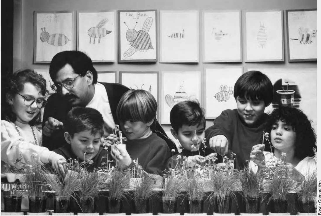
Third graders experiment with seedlings, Pittsburgh, Pennsylvania.

The modern sovereign form of nation-state, as expressed by the U.S. 1776 Declaration of Independence, emphasizes the fostering of those creative powers of scientific and other discovery, by means of which each person may be enabled to participate in and contribute to the progress of the human condition from one generation to the next.