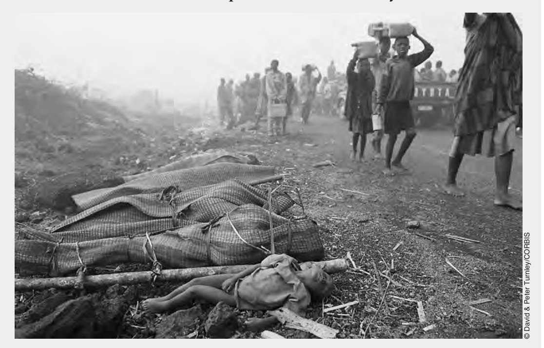
Refugees fleeing Rwanda's civil war pass corpses at roadside.

What we do, or fail to do for Africa, has a special quality of significance for humanity as a whole. It will be an emblem of our conscience, a mission whose success will attest to the fact that we, of all parts of this planet, have become truly human, at last: truly human in our conception of the universality of human nature.