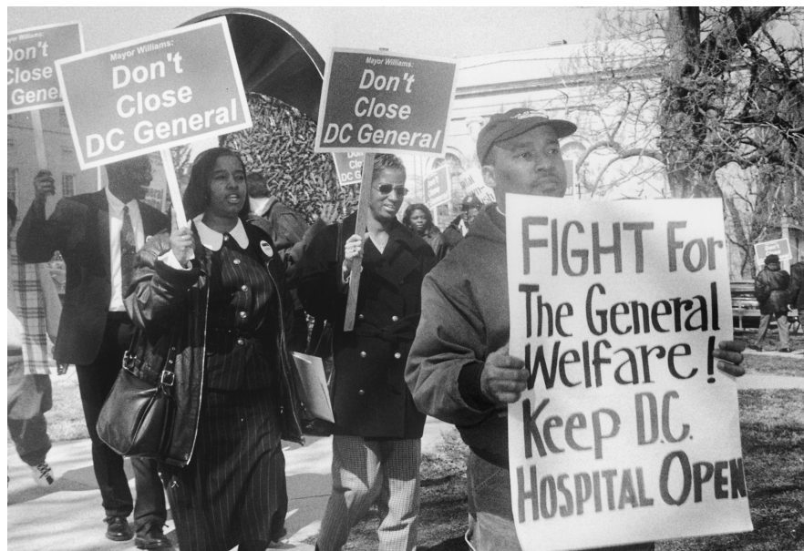
March to save Washington's D.C. General Hospital, March 8, 2001.

"There can be no argument that the world has entered the greatest financial and economic crisis in modern history. In the context of that crisis, the United States is at a crossroads. Either we re-adopt the commitment to the General Welfare clause of the U.S. Constitution that was the basis of both Franklin Roosevelt's policies and Dr. Martin Luther King's, or we will find our