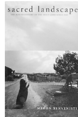
Sacred Landscape: The Buried History of the Holy Land Since 1948 by Meron Benvenisti Berkeley, University of California Press, 2000 340 pages, hardcover, $35.00

The technical part of this task involved giving Hebrew names to the towns and villages which had been inhabited by Arabs. The effect was to successfully erase the old landscape, which had been dotted by more than 200 Arab villages, eliminating the evidence that Arabs had once lived there. As Benvenisti points out, map-making was used by the British as a special weapon for imposing colonial domination, and this