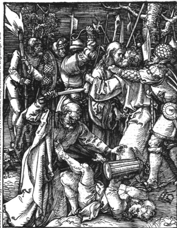
"Betrayal of Christ," Small Passion , 1508-1510.

Now, contrast these woodcuts with the depiction of the same subject, the "Agony in the Garden" [SEE inside back cover, this issue], from the Engraved Passion . (Both series were done between 1508 and 1510.) The first thing you will notice, is that the engraving technique allows for considerably more detail and refinement of shading—the many "colors" between white and black—which permits the artist a greater freedom of expression. Look now at the composition itself: It is fully self-contained. The figure of Christ curves slightly into the space of the picture;