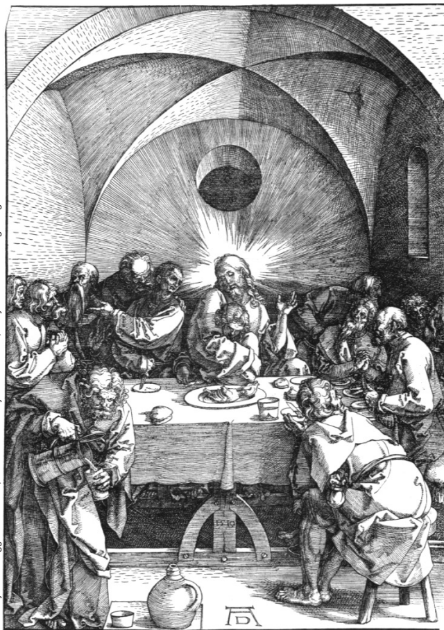
“Last Supper,” Large Passion , 1510.

In the Large Passion of 1510, the composition is starkly symmetrical, with Christ placed dead center, a starkness which is reinforced by the sharp chiaroscuro (contrast of light and dark). The architectural elements conspire to highlight and reinforce Christ’s central role, and, as in Leonardo’s “Last Supper,” the moment is that just after Christ has announced, “One of you will betray me.” Even Dürer’s famous “AD” is placed to reinforce the central axis of the composition. So, despite the dramatic tension of the moment, and the turmoil of most of the