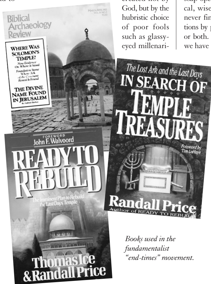
Books used in the fundamentalist “end-times” movement.

The key to the answer lies in a question: What makes a nitwit such as our typical millenarian fundie tick? How do such fundies, in effect, control a majority among those American Jews, who, on other issues, would be generally too civilized, too rational, to fall for the kinds of games