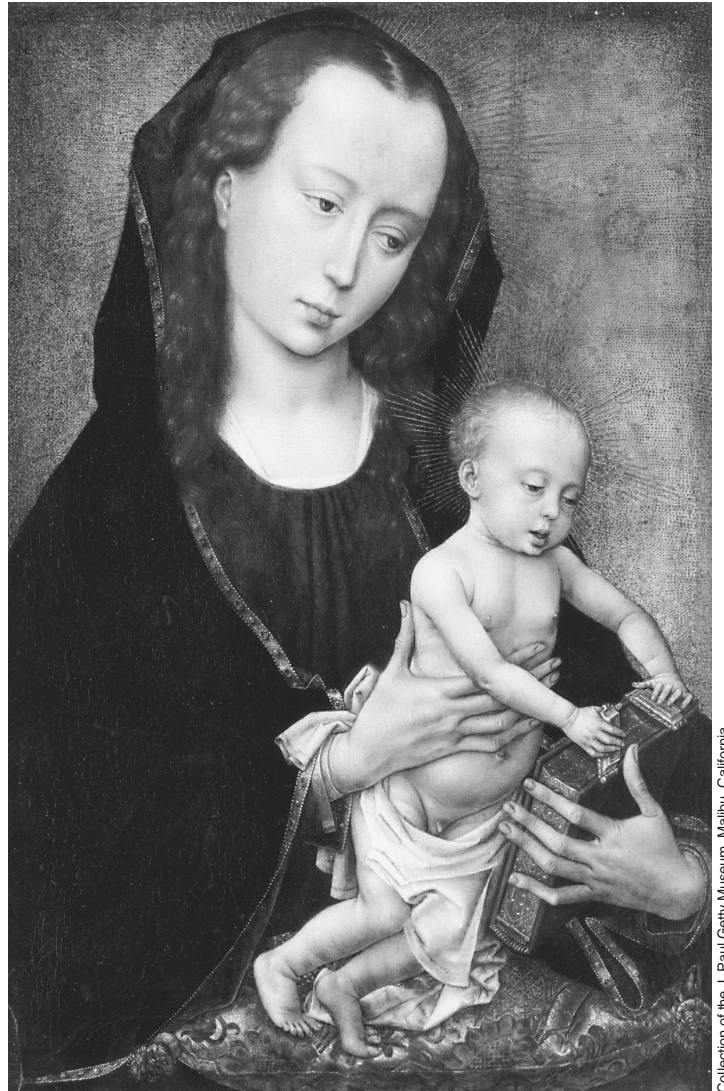
Rogier van der Weyden, “ Madonna and Child ,” c. 1460.

As set forth in the opening of the Gospel of John, the mystery of Christ is not a matter of blind faith, but a fully comprehensible fact of Reason, and thus knowable to all, Christians or not, who do not remain hysterically resistant to the influence of Reason.