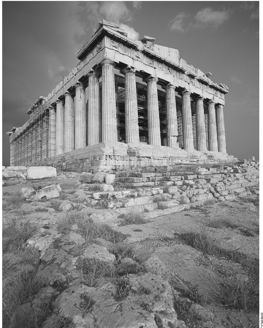
The Parthenon, greatest structure of the Athenian Acropolis. It was built beginning 447 B.C. under the direction of the sculptor Phidias.

Plato's Greece is the first location in known history, at which the idea of ideas in general is clearly defined. The difference is between the discovery of several or more experimentally validatable individual physical principles, and the discovery of the Platonic principle of universality underlying physical science in general. Typical of this difference, is the appearance of Classical Greek notions of sculpture, as typified by the celebrated influence of Scopas and Praxiteles, and by the great Classical tragedies. By the idea of the idea , we should mean, implicitly, and most essentially, the idea of man as made in the living cognitive image of the Creator of the universe.