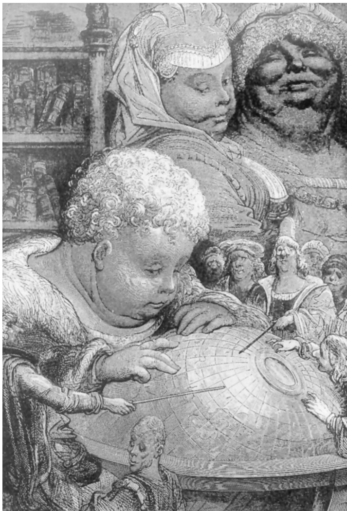
The education of Gargantua. Illustrations by Gustave Doré.

An Introduction To the Universe of François Rabelais