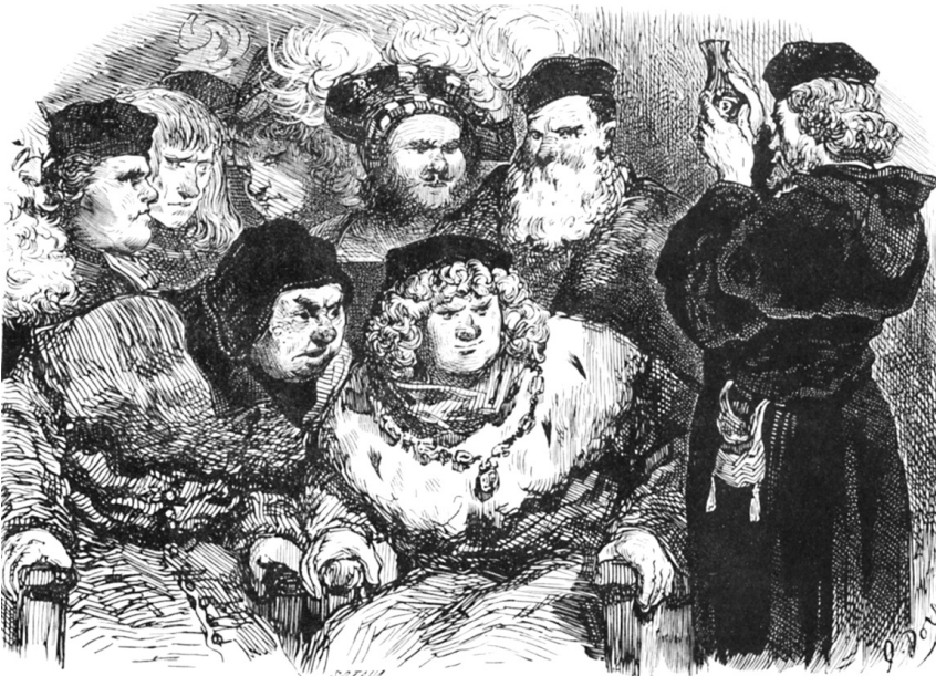
A learned council prepares to teach the philosophy of Aristotle.

However, one bright morning, Grandgousier realized that this education was not very profitable to his son, and that, on the contrary, he was going crazy, getting stupid, and turning into a dreamer and a dotard. He inquired among other authorities, who told him that he would be better off not getting any instruction, rather than to have such books and such tutors. Then they made the decision to compare the judgmental capacity of Gargantua against that of “one of those young present-day students, who had only two years of studies.” It was at that time that a young page named Eudemon, who was barely twelve years of age, was introduced to them. He was “so well curled, so well dressed, so well brushed, and so courtly in his behavior, that he was more like some little angel than a human being.”