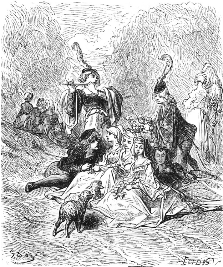
View of the quiet pleasures enjoyed by the inhabitants of the Abbey of Theleme.

er words, the purpose was not to reflect one's allegiance to a given faith, or to express thanks for some grace received, or to acquire some benefit through obedience to some fixed rule. All the inhabitants of Theleme well understood that the best that they could do in the world, was to act according to "their own free will"; that is, to obey "the will of God."