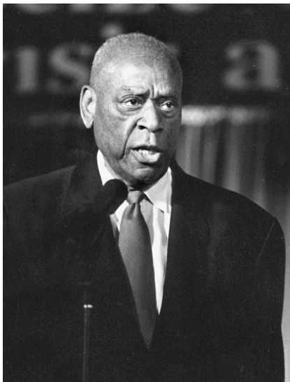
Baritone Dr. William Warfield

At the end, Warfield closed the circle by singing "Deep River," which moved many in the audience to tears.