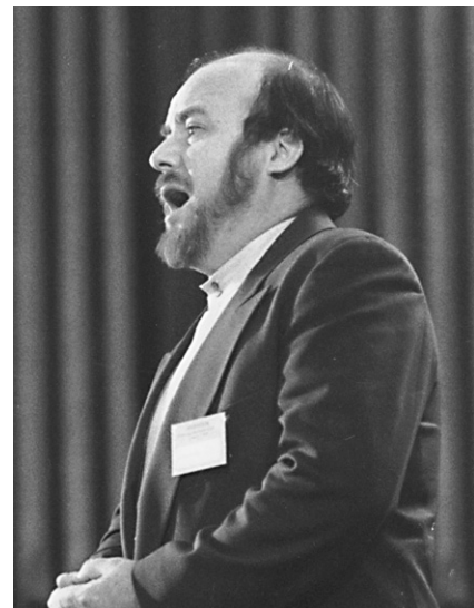
Tenor Alfredo Mendoza