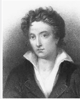
Percy Bysshe Shelley