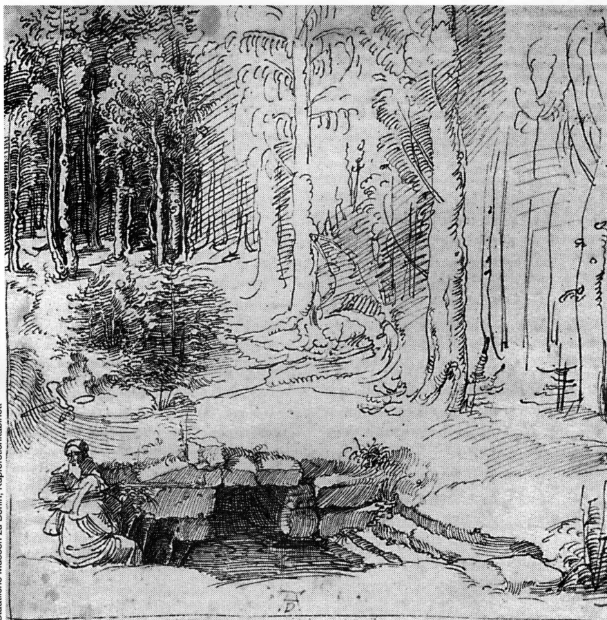
Albrecht Dürer, "Spring in a Forest, with St. Paul and St. Anthony," c. 1500.

A completely different mood is presented in the double portrait of Holbein's two sons, Ambrosius and Hans the Younger [SEE inside back cover, this issue], both of whom became artists in their own right. Hans, who would become by far the most important artist in the family, would have been about 11 years old, and Ambrosius 14, at the time their father portrayed them in 1511. Not at all sentimental, the portraits nevertheless reveal the emerging, and distinct,