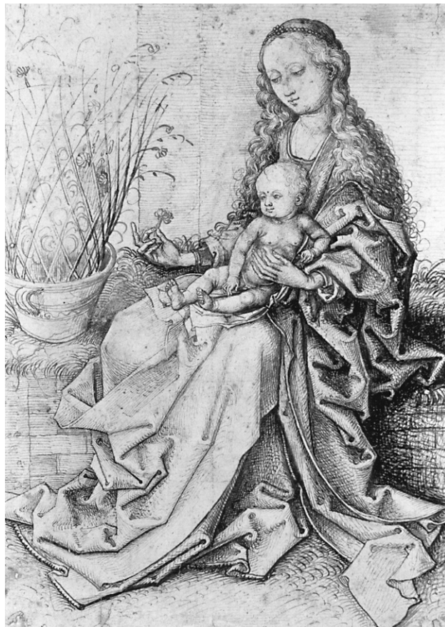
Martin Schongauer, “The Madonna with a Pink,” c. 1475-1480.

An excellent example of Cranach’s artistic and moral outlook is a sensitive portrait of a peasant, painted around 1525, or soon after the Peasant Wars began. It is a simple watercolor sketch, where the immediacy of the brush strokes, and the intimacy of the perspective, allow us to look directly into the soul of the man, through his eyes. The hint of a smile around the mouth, and the rough-hewn texture of his skin, suggest that the subject is a common man, a worker or peasant, with a strong character and an optimistic outlook on life, despite the tragedy unfolding around him.