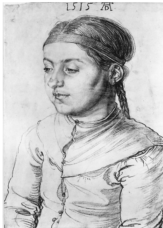
Albrecht Dürer, “Portrait of a Young Woman,” 1515.

One of the most striking of Dürer’s drawings is the “Head of the Evangelist Mark,” 1526. It is rendered on paper prepared with a brown wash, with lead-tin point, and its ghostly