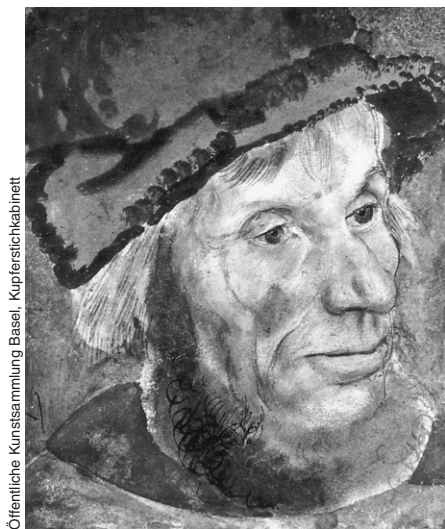
Lucas Cranach, the Elder, “Head of a Peasant,” c. 1525.

Staatliche Museen zu Berlin, Kupferstichkabinett