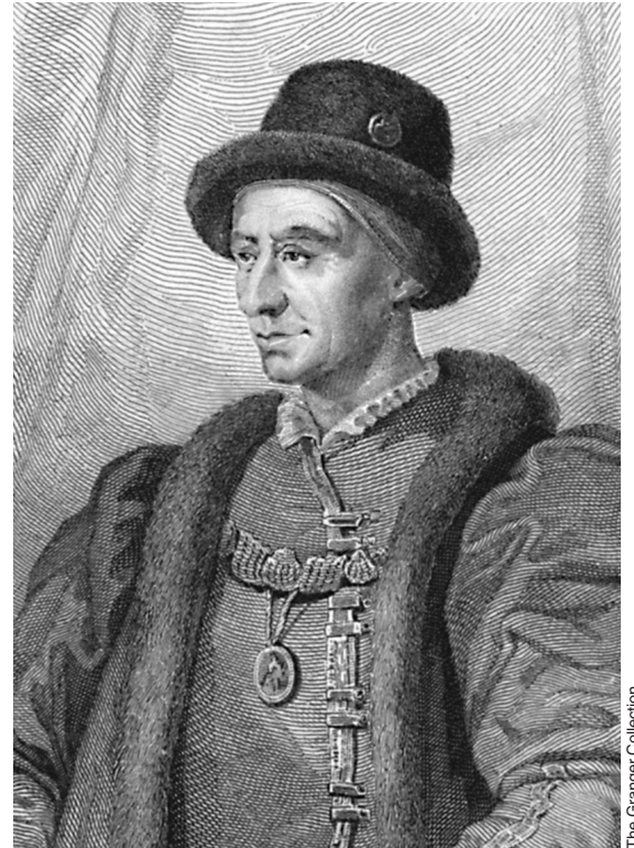
France's King Louis XI (reigned 1461-1485).

Like the government of Louis XI, that of Henry was also influenced by the Brothers of the Common Life. Henry chose as his chancellor, Bishop John Morton, who