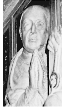
Left: Cardinal Nicolaus of Cusa. Below: Cathedral of Florence. The dome, designed by Filippo Brunelleschi, was completed just before the 1439 Council.

The radiated impact of the affirmation of the Platonic principle of natural law by Cardinal Nicolaus of Cusa, in the context of the Council of Florence, laid the basis for the introduction of a new form of state by France's Louis XI. The modern nation-state would promote the general welfare, by developing the cognitive capacity of the people, so as to increase mankind's power over nature through scientific and economic development.