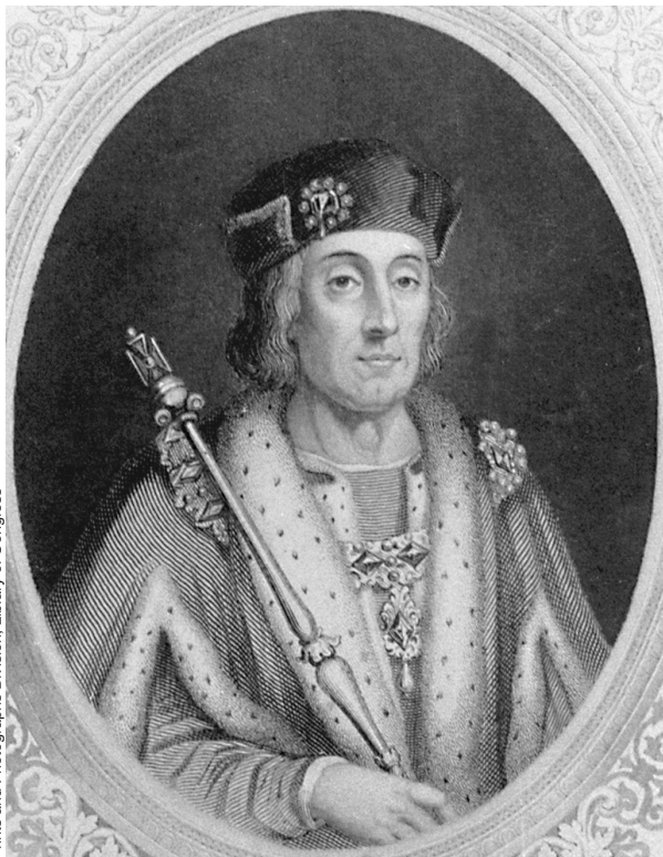
England's King Henry VII (reigned 1485-1509).

Laws enacted and enforced by Henry VII parallel those of Louis XI: He imposed a heavy duty upon wool shipped to Europe, to prevent the raw material being carried out of the country, and encourage home manufacture of cloth. He enacted an early form of capital controls. And, in respect to the question of justice for all, Henry issued a proclamation commanding justice for 'all manner of men, as well the poor as the rich.'