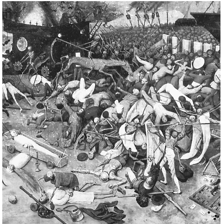
Pieter Bruegel the Elder, “The Triumph of Death,” 1562-64 (detail).

The Fourteenth-century Dark Age is a model for what today’s globalists will plunge us into once again, if we do not succeed in rooting out the financial oligarchy once and for all. This Hell on Earth was depicted by the painter Bruegel in ‘The Triumph of Death.’