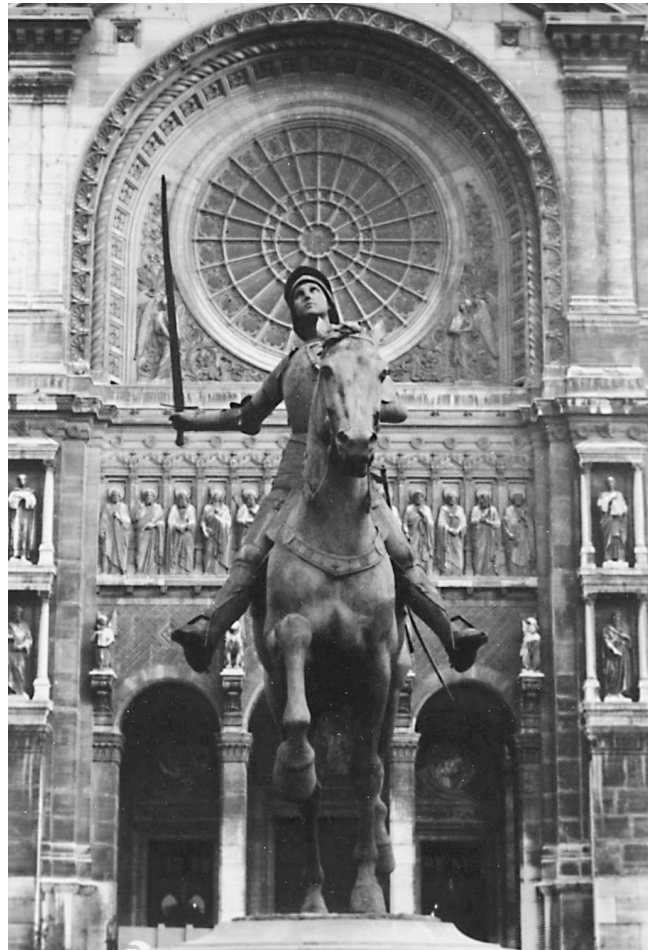
Equestrian statue of Joan of Arc, St. Augustine Church, Paris.

In the Peace of Faith , written immediately after the conquest of Constantinople by the Turks in 1453, Cusanus establishes natural law as also the basis for foreign policy among diverse peoples and nations. Cusanus argues in dialogue format, using a character based on the Apostle Paul, that despite different religions having received their commandments through the hands of various prophets, the divine commandments are known uni-