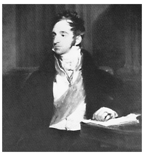
Count Karl Robert Nesselrode, Russian Minister of Foreign Affairs

As stated above, Heeckeren's participation in making the "diploma" seems quite dubious, despite his closeness