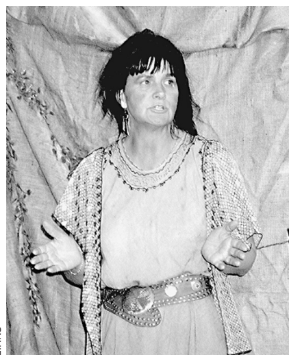
Io is tormented by Zeus—but, as Prometheus foresees, her descendant Hercules will triumph over the Olympian gods.

After the performance there was considerable discussion, including a comment from an English literature lecturer, who insisted that all Greek drama was about how mankind was at the mercy of Fate , and that this play was no different. At that point, another attendee stood up and objected, saying that the whole point of the play was exactly the opposite—that Prometheus demonstrated that it is possible to act with reason and courage, in a noble way to change one's circumstances—that one doesn't have to be enslaved and a victim of so-called greater powers.