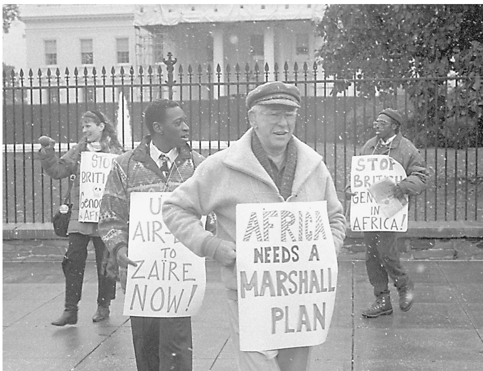
Schiller Institute demonstration at the White House, Washington, D.C., November 1996.

oligarchy, is an absolute prerequisite to defeat the evil in Africa today. The I.M.F. and the development of Africa are mutually exclusive. They cannot co-exist.