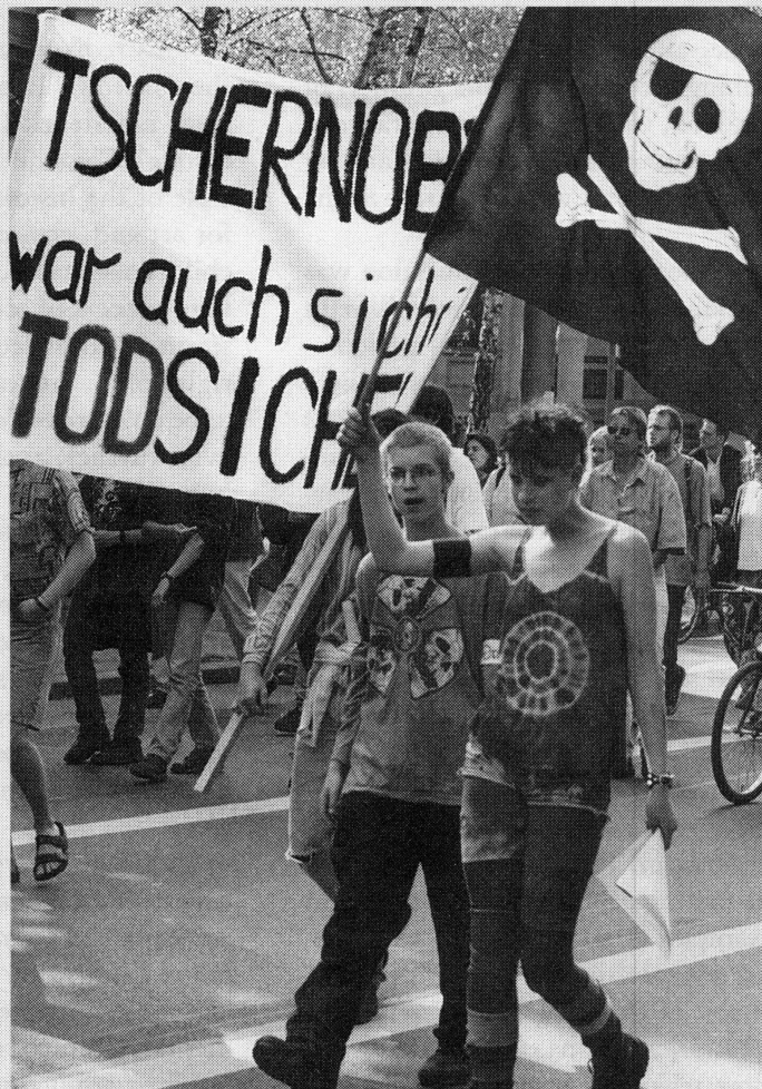
Antinuclear demonstration, Wiesbaden, Germany, April 1996.

The demonization of scientific and technological progress occurred through such oligarchic institutions as the Club of Rome and the infamous M.I.T. study of the Limits to Growth . In a world which is ostensibly limited anyhow, where there is nothing new or additional to discover, it is natural that the motivation of youth to learn something, or to study, or to do anything inspired, will be lost.