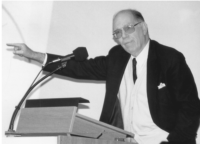
Lyndon H. LaRouche, Jr., keynotes conference in Germany.

LaRouche singled out the Japanese banking system, which is carrying $2 trillion in non-performing debt, as the number one threat to blow out the global financial system. Brazil, which is in the process of negotiating a disastrous "bailout" package with the International Monetary Fund (I.M.F.), could also trig-