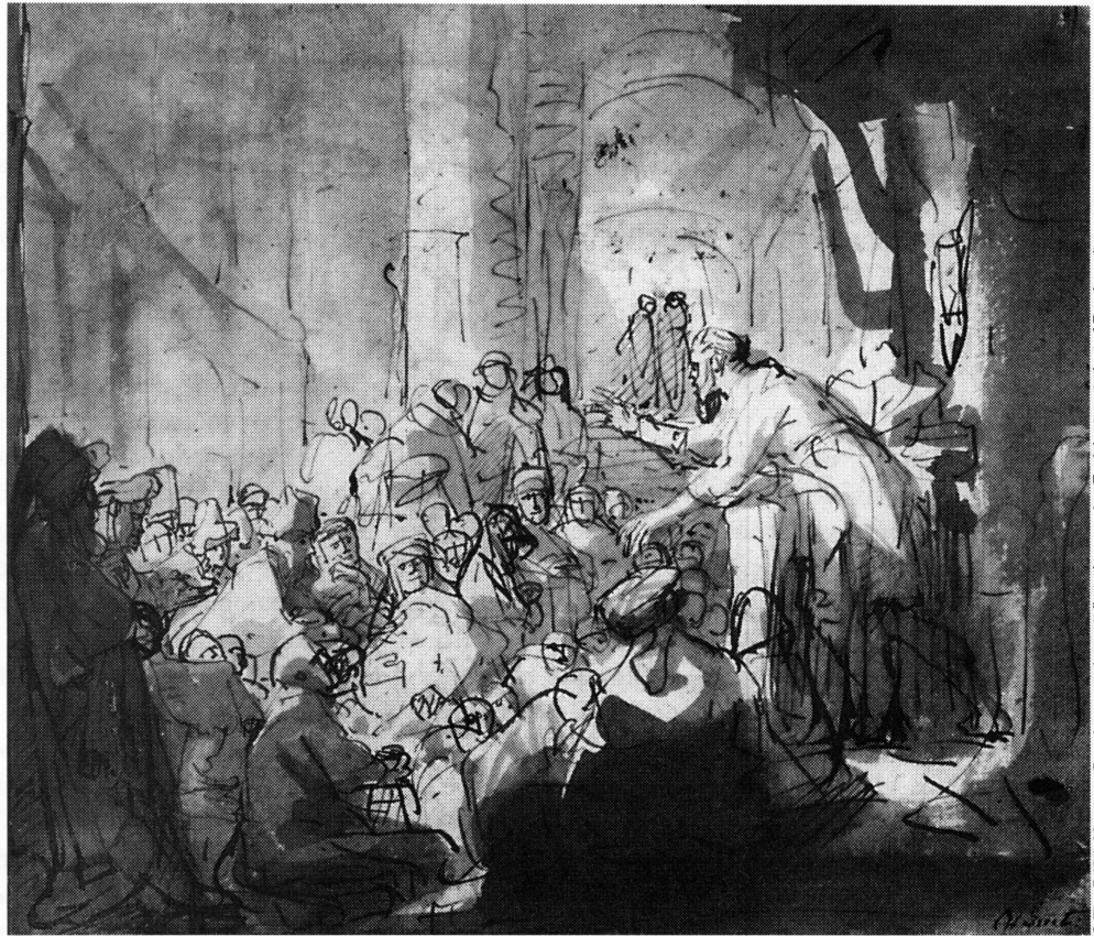
"St. Paul Preaching at Athens," pen and bistre, wash (c.1637).

If reason must be controlled by passions, rather than the dead hand of mere logic, what shall govern these passions? How do we distinguish, those passions and forms of passion which are irrational, from those contrary forms which are the seat and substance of reason? This is the issue of culture, the issue which places Classical culture morally and otherwise apart from and above all currently popular misconceptions of culture.