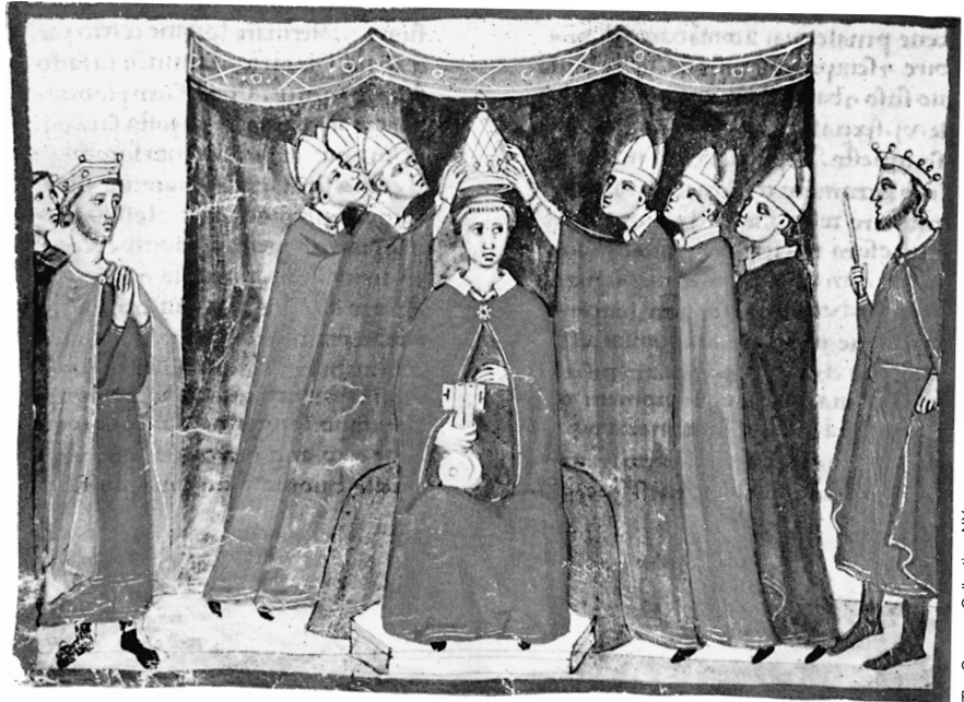
Papal Schism: Coronation of Clement V in 1305, inaugurates the “Babylonian Captivity” of the Popes at Avignon. (Miniature from the Cronaca Villani)

In 1375, the war for control of the Papal States had