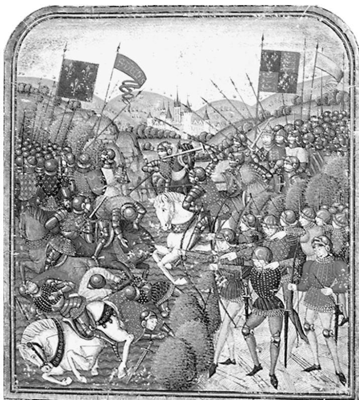
Technological Innovation: English King Henry V's yeomen archers triumph over French feudal knights at the Battle of Agincourt, Oct. 25, 1415. (Manuscript illumination, 15th century)

However, the very fact that a society is organized on the basis of an entropic hypothesis, which clearly violates the natural-law ordering of both human nature and the physical universe, dictates that such a society must necessarily devolve. This devolution, in turn, inexorably results not only in a self-weakening and discrediting of that society, but also in the potential for a reverse cultural-paradigm shift, back to an anti-entropic universe, in restored harmony with natural law. Again, as in Shelley's poem "Ozymandias," this potential for an alternative, anti-entropic course, is expressed "between the lines," through the principle of metaphor.