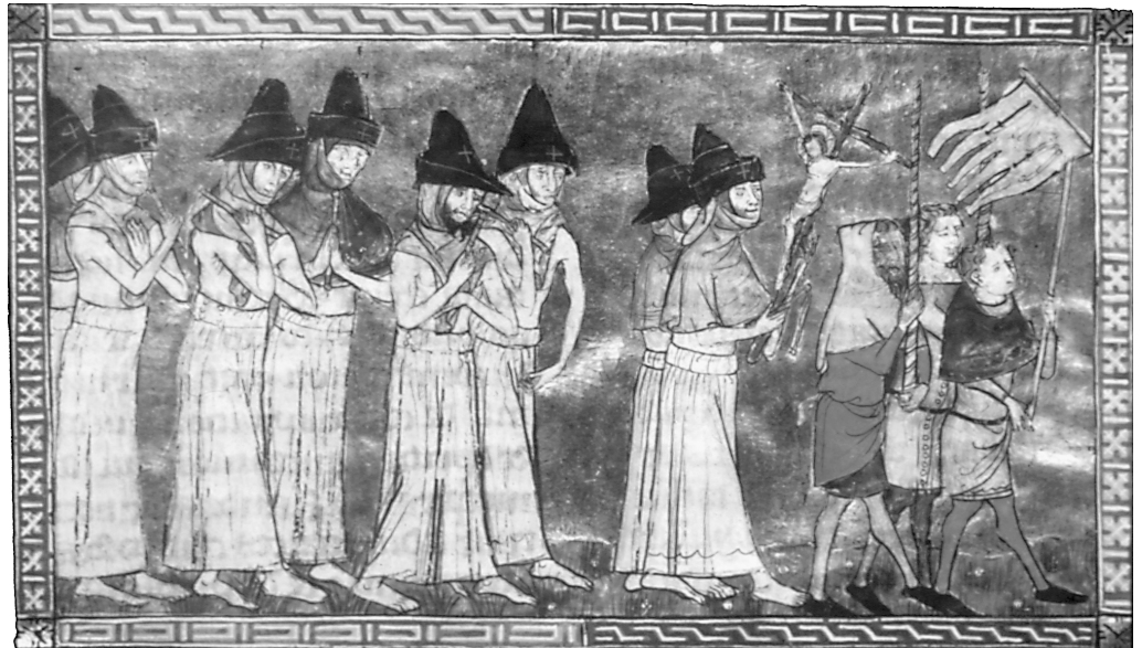
Religious Irrationalism: Procession of Flagellants during an outbreak of the Black Death. (Flemish manuscript illumination, 14th century)

In Avignon, it was said, 400 died daily; 7,000 houses