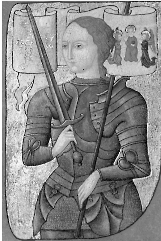
The Granger Collection, NY

Dante, an opponent of the Black Guelph, who was exiled from his native Florence, wrote in De Monarchia (1310-13), that “the proper work of mankind taken as a whole is to exercise continually its entire capacity for intellectual growth.” In De Vulgari Eloquentia , he argued that the creation of a literate form of vernacular language, common to an entire nation, is a necessary precondition for the intellectual growth of a people, and for the development of its capacity to exercise self-government. Dante was not able to implement this perspective during