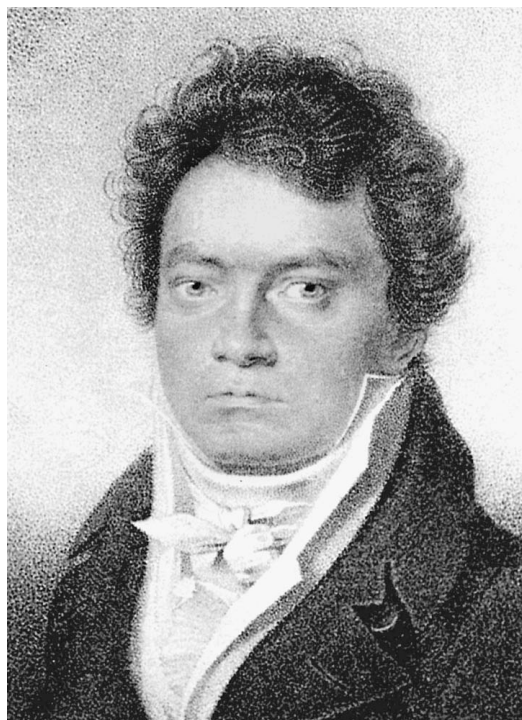
Portrait of Ludwig van Beethoven, 1814. (Engraving by Blasius Höfel, after the painting by Louis Letronne)

Before Beethoven attempted string quartets, he wrote three string trios, to develop his composi-