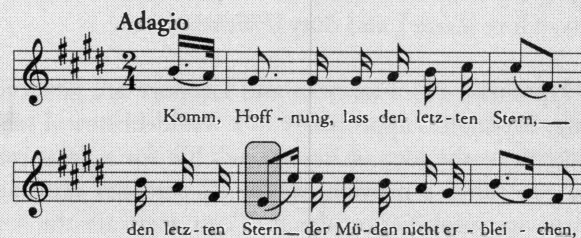
FIGURE 3. "Come, Hope, let the last star"

order to get along with his or her personal life, and love becomes eros —the erotic fixation on possessing objects.