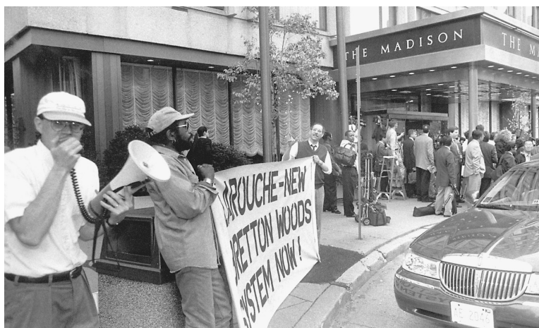
Schiller Institute campaigns for a "New Bretton Woods System" at G-22 Finance Ministers meeting, Washington, D.C., April 16, 1998.

Treasury Secretary Rubin on April 16, to agree to deal with three crucial topics: