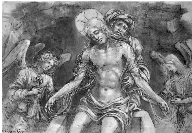
Allen Memorial Art Museum, Oberlin College, Oberlin, Ohio

Filippino began life in the shadow of scandal, having been born the son of the Florentine painter and Carmelite monk, Fra Filippo Lippi, and Lucrezia Buti, a nun from the convent of Santa Margherita. (Being born out of wedlock was no bar to success as an artist, however, as Leonardo’s own illegitimate birth attests.) Despite Filippino’s colorful origins, Vasari reports that he led an exemplary life, joining the Confraternity