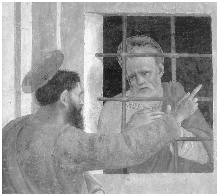
Filippino Lippi, "St. Paul Visits St. Peter in Prison" (detail), fresco, Brancacci Chapel.