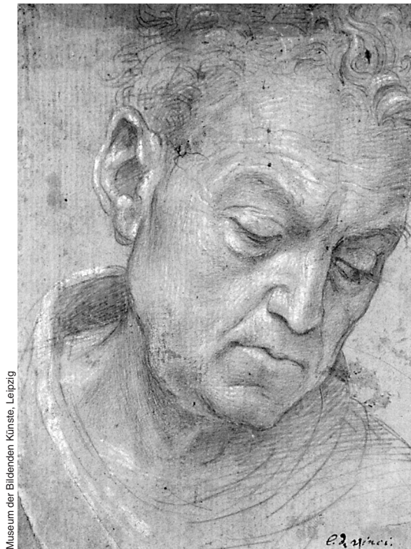
Museum der Bildenden Künste, Leipzig

Another small change in the structure of the composition—drawing the angels in closer to the central triangle, formed by Christ and the Saint, and enfolding them within the same shadow that surrounds the dead Christ—reinforces the pyramidal shape, whose triangular stability suggests an unchanging Eternity. And, the changed expression on the face of the angel to the left of the panel—who now gazes directly at the face of Christ, whereas in the original drawing, the angel's gaze is more ambiguous—helps to direct our eyes to Christ's countenance also.