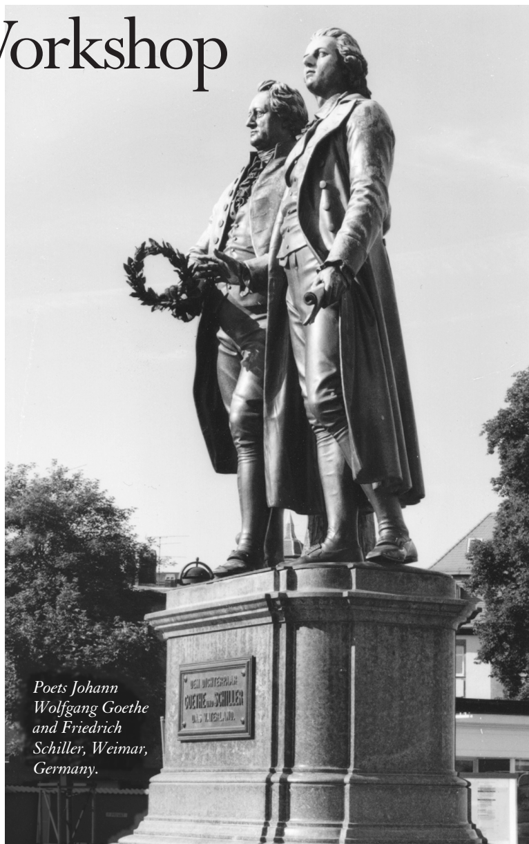
Poets Johann Wolfgang Goethe and Friedrich Schiller, Weimar, Germany.

Schiller himself, and with him Johann Wolfgang Goethe 1 and a few others, answered this challenge and broadened the “realm of beauty”—through which we necessarily must pass to reach the “realm of freedom”—with ever more poetic and dramatic works, which he laid before his pub-