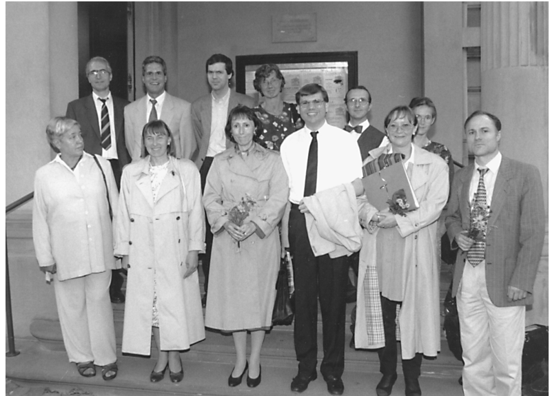
Dichterpflänzchen—"budding poets"—group assembles after poetry recital, September 1997.

This is the last ballad which was created