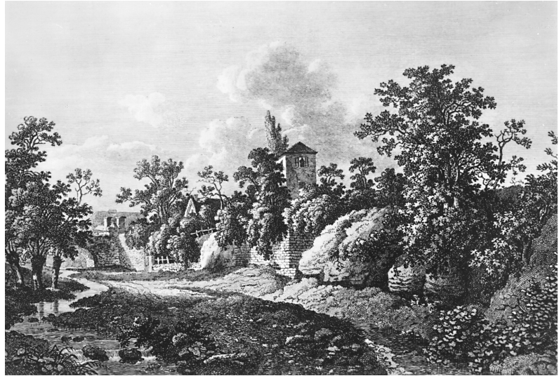
Schiller's garden in Jena.

The “small poem” has the title “The Treasure Seeker,” and has, as we see so often with Goethe, autobiographical characteristics. Goethe had ordered a lottery ticket in Hamburg and was hoping to win the first prize, a farm estate in Silesia. But he very soon came to realize that this was a useless undertaking. Reason, depicted in the poem by a beautiful youth, carrying a full, beautiful chalice, returns and disabuses the treasure seeker from his foolish superstition.