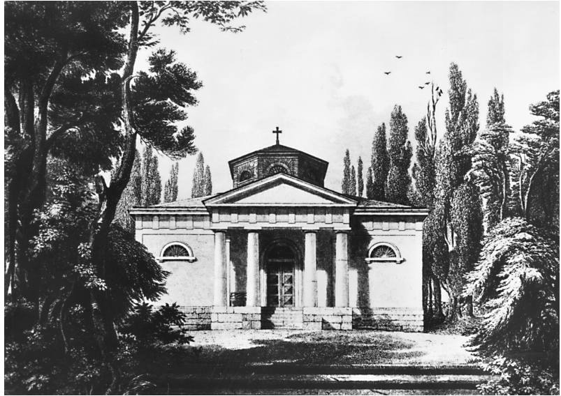
Goethe-Schiller tomb in Weimar.

One week after “The Glove,” Schiller sent “The Ring of Polycrates” to Goethe. Goethe in the meantime had composed “The Sorcerer’s Apprentice.” In this poem he sends the anti-Xenists packing. The Xenien were those small distichs in which Schiller and Goethe had, the year before, settled their accounts with all of educated society. These two-liners had provoked a veritable storm, and some of those addressed gave way to anger and answered small-mindedly with inscriptions which culminated in “To the slapdash cooks of Jena and Weimar”—referring to Schiller and Goethe. The small-minded were again ridiculed in Goethe’s “Sorcerer’s Apprentice.”