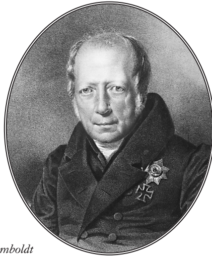
Wilhelm von Humboldt