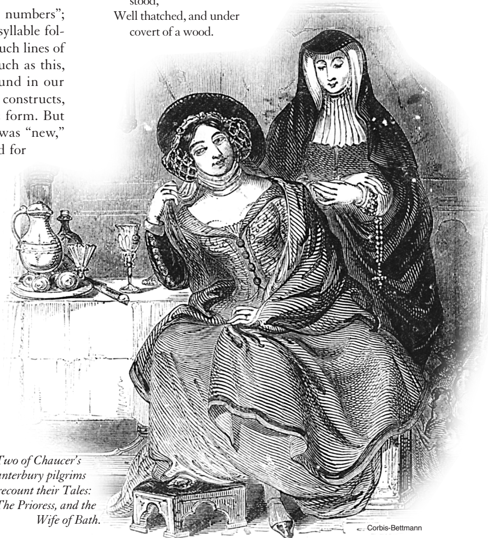
Two of Chaucer's Canterbury pilgrims recount their Tales: The Prioress, and the Wife of Bath.

A povre wydwe, somdeel stape in age Was whilom dwellyng in a narwe cotage, Biside a grove, stondyng in a dale. This wydwe, of which I telle yow my tale, Syn thilke day that she was last a wyf, In pacience ladde a ful symple lyf, For litel was hir catel and hir rente. By housbondrie of swich as God hire sente She foond hirself and eek hir doghtren two. . . .