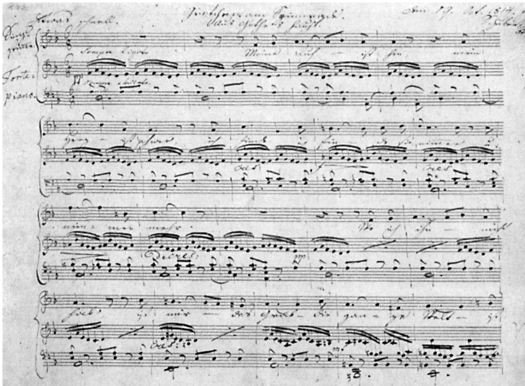
Autograph of “Gretchen am Spinnrad” (“Gretchen at the Spinning Wheel”) (1814), Schubert’s first masterpiece of lied composition. “The song represented a huge leap; there really aren’t any forerunners. It was like a bolt of lightning.”

Fidelio: And therefore he was seeking not just to compose a poem, but rather he was trying to grasp the poet’s underlying character.