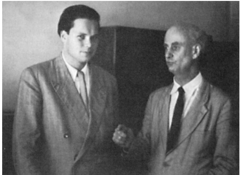
Fischer-Dieskau (left) with the conductor Wilhelm Furtwängler. "After he had inspired me to the 'Four Serious Songs' of Brahms at a manorhouse in Salzburg, he treated me as his own son."

Prof. Fischer-Dieskau: Yes, that's so. Many, many composers have only found their way to a certain form, through familiarizing themselves with texts. A famous example is Nietzsche, who was a musical dilettante, but who wanted to compose anyway. And Hans von Bülow, after looking over his compositions, gave him this very intelligent advice: "Write songs, and stick to the text. Then you will find at least one red thread, or a guiding hand, that will show you the way." And so it came to pass, that his songs were far and away the best musical pieces he ever produced.