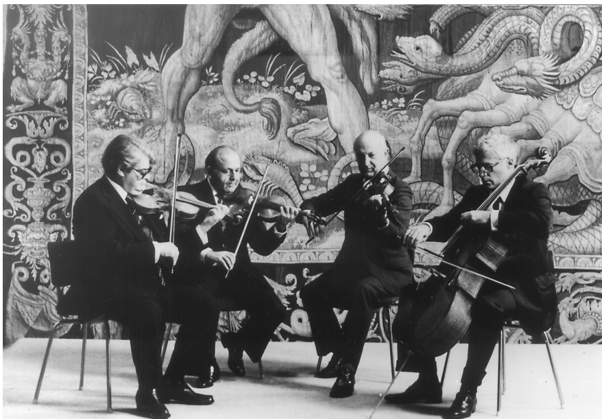
The Amadeus Quartet.

But, back to his mode of composition: Schubert had