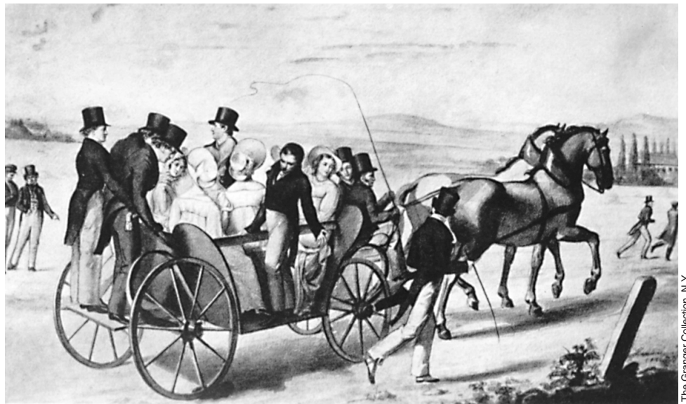
“An excursion of Schubertians,” memorialized by Schubert’s friend, the artist Leopold Kupelwieser. Above: The journey to Atzenbrugg; Schubert and Kupelwieser are standing at the back of the carriage. Right: Schubert (bottom left) provides piano accompaniment for the amateur theatrical. (Oil painting and watercolor by Kupelwieser, 1820.)

Fidelio: But it is known—you already mentioned it—that, just as with Haydn, whose quartet output, following his revolutionary “Russian” Quartets Op. 33, had a lapse of almost ten years, Schubert also had a long lapse between his early and his later quartets; and the only