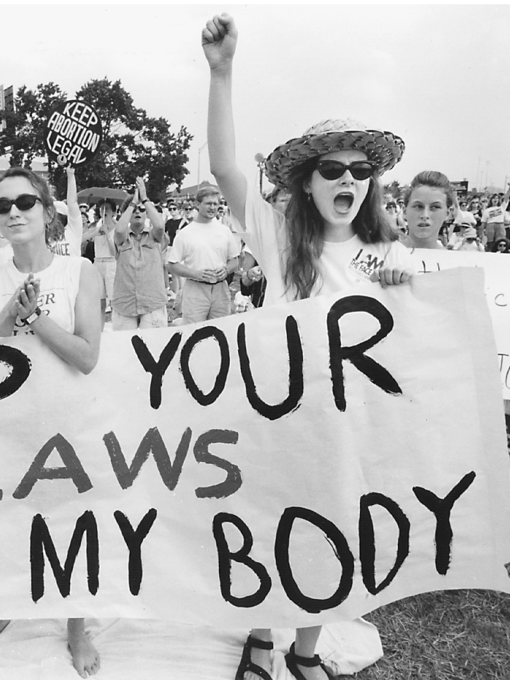
"Anyone who adopts the axiomatic standpoint of 'My Bawd-dy,' will be a racist whenever suitably prompted, and will find the 'pro-choice' argument unassailable." Left: "pro-choice" rally, 1992.

acy, economy, and even simple interpersonal morality, a kind of abomination, a global catastrophe. On this level, it can be demonstrated, that, relative to the mid-1960's appeal to reason by the Rev. Martin Luther King, today's "mainstream opinion" expresses a retrograde movement in ideas and social practice.