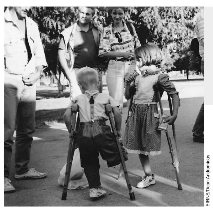
Two children who lost a leg during the siege of Bihac.

sometimes three times, or ten times. It usually happened at night, when the troops came.