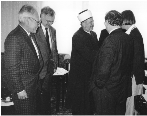
Left: The delegation meets Sarajevo's Islamic religious leader, the Rejs Ulema, Dr. Mustafa Effendi Cerić.