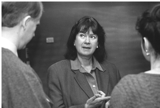
Helga Zepp LaRouche speaks to reporters at Feb. 20 press conference.

delegation organized by the Schiller Institute visited Croatia and Bosnia. After intensive meetings and tours, the delegation concluded that it is not enough to stop the most brutal features of the Greater Serbian aggression and genocide temporarily, if such aggression were to be replaced with "genocide through financial means." The delegation recommended the following measures: