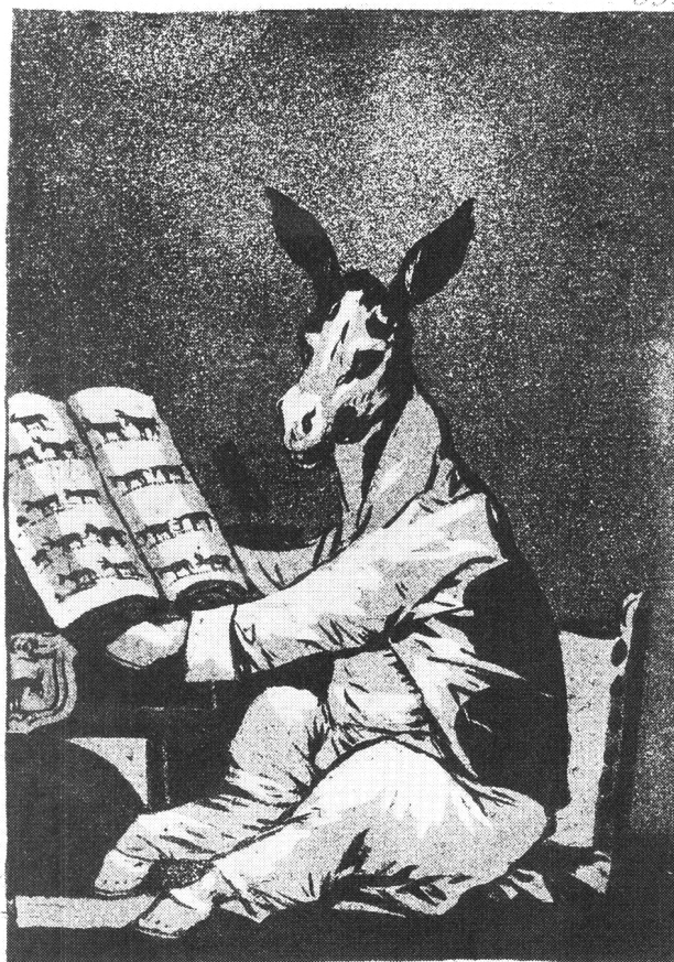
The Metropolitan Museum of Art, NY, Gift of M. Knoedler & Co., 1918

Had Goya died in 1797, we might know him only as a gifted rococo artist of the Venetian school, and a poignantly truthful portraitist. What imprints on future generations his Socratic genius, is what he did after the age of fifty, represented in this exhibit particularly by the etchings starting with the Caprichos of c.1800. We may ask, how these works, so often dark in mood, match up to challenge of the late Beethoven in his opera Fidelio , his late string quartets, his Missa Solemnis , or his Ninth Symphony, which celebrated the divine spark of