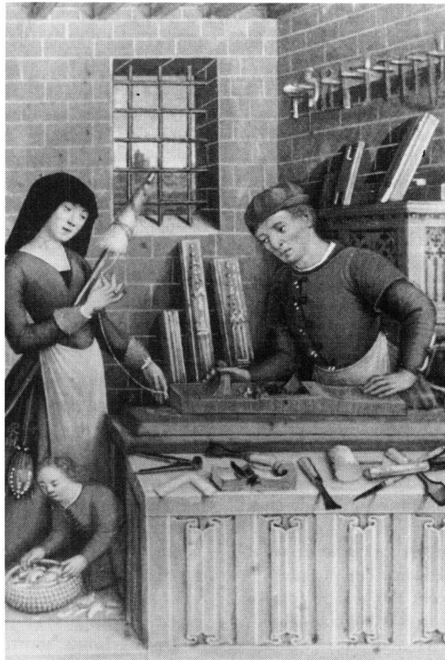
Cabinetmaker's workshop: Louis XI encouraged development of skilled trades, and immigration of craftsmen to France (illustration from a Fifteenth-century manuscript).