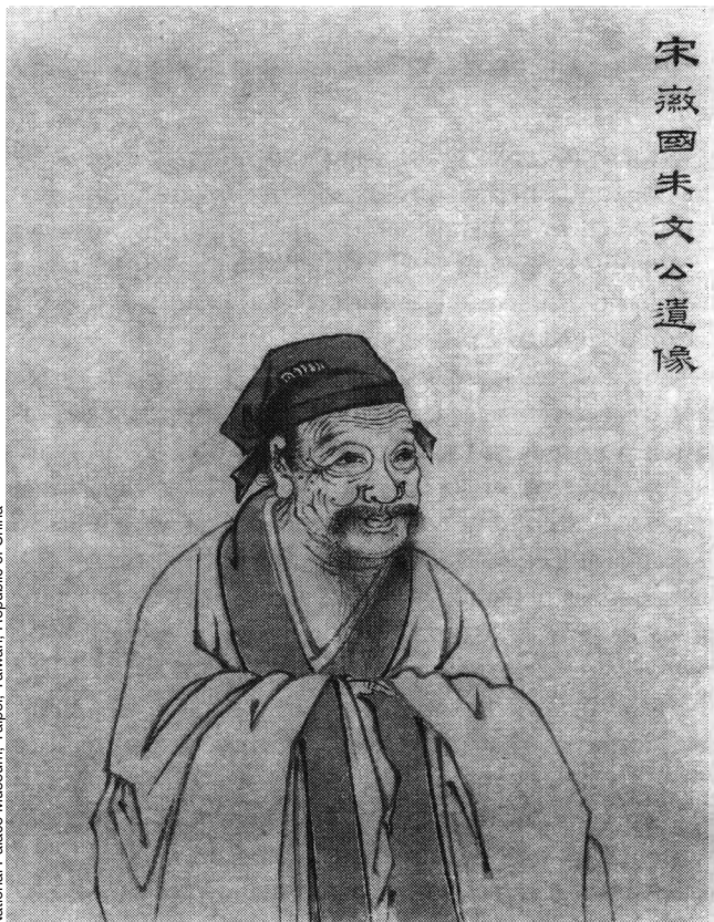
The philosopher Chu Hsi. His Sung Dynasty Neo-Confucian Renaissance laid the basis for rapid scientific and economic development.

ing the gnostic and empiricist metaphysics of the Taoists, and the mysticism of the Ch'an (Zen) Buddhists. Wang Yang-ming, three centuries later, unable to comprehend the fundamental ideas and method of Chu Hsi, and after more than twenty years as a Taoist, developed an amalgam of Taoist metaphysics and Confucian Rites, perverting the Confucian tradition and fostering an acceptance of an immoral syncretic mix of Confucianism, Taoism, and Ch'an Buddhism. This, we will see, was the ideology embraced by the Enlightenment figures in Europe.