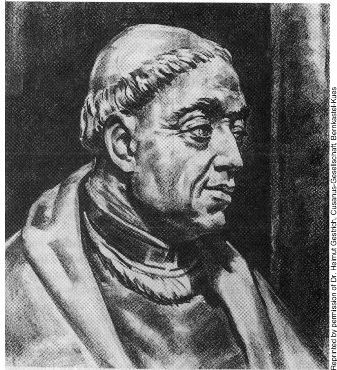
Cardinal Nicolaus of Cusa, whose philosophical works initiated modern science in the Renaissance.

Surprisingly, then, Hans Küng writes that the meta-