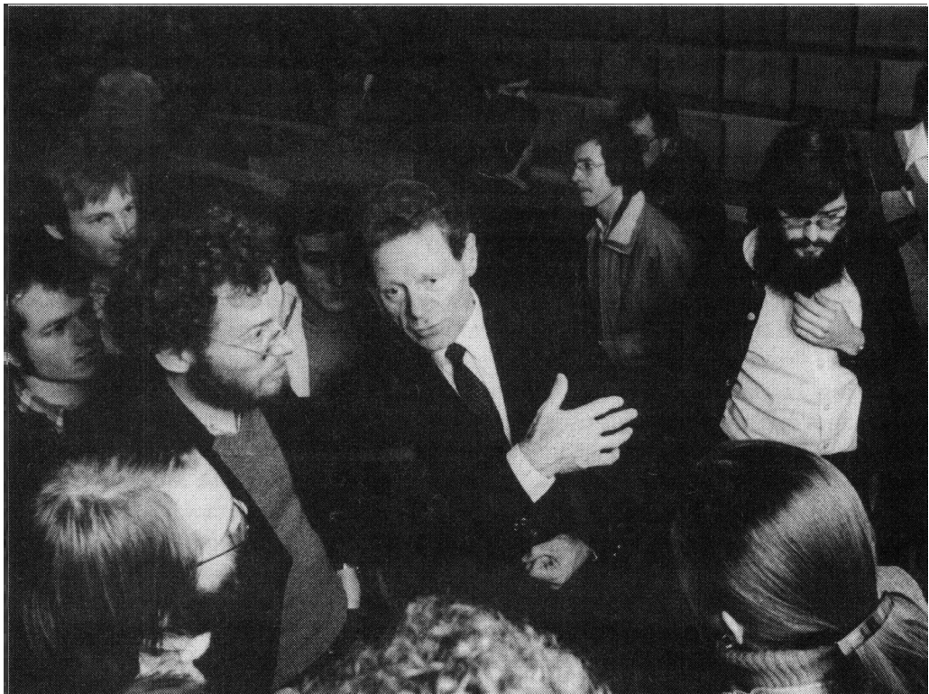
Hans Küng (center) with students at Tübingen University. Despite his claims to be a Christian theologian, Küng seeks to submerge the Christian Platonic tradition of the West in a swamp of mindless New Age Taoism.

In 1988, Küng co-authored with Julia Ching a book entitled Christianity and Chinese Religions , in which they review, one at a time, the "Three Religions" of China.