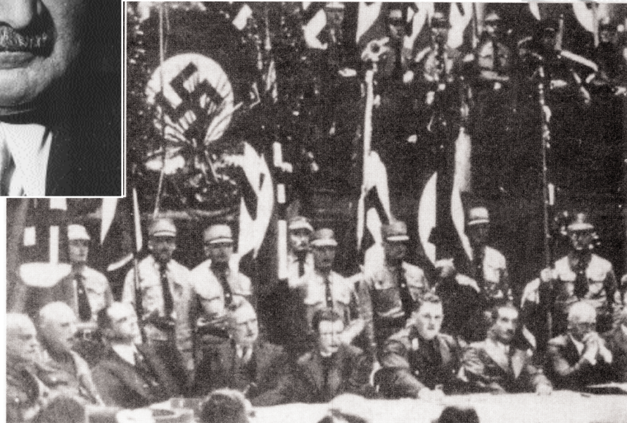
Left: Martin Heidegger, as he appeared in 1970 as one of the century's most widely acclaimed philosophers. Below: Heidegger (3rd from right) pledges allegiance to the Nazi regime and the Conservative Revolution's Adolf Hitler (right) in November 1933.