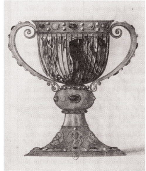
Left: The chalice of Abbot Suger, on display at the National Gallery of Art. Top: This 1633 drawing of the chalice shows the hyperbolic curve of the original foot, prior to a modern-day restoration.

bequeathed his art collection to the National Gallery.