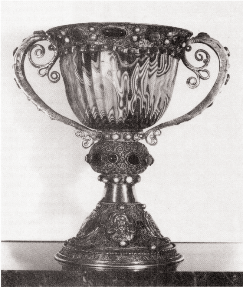
The National Gallery of Art, Washington, D.C.