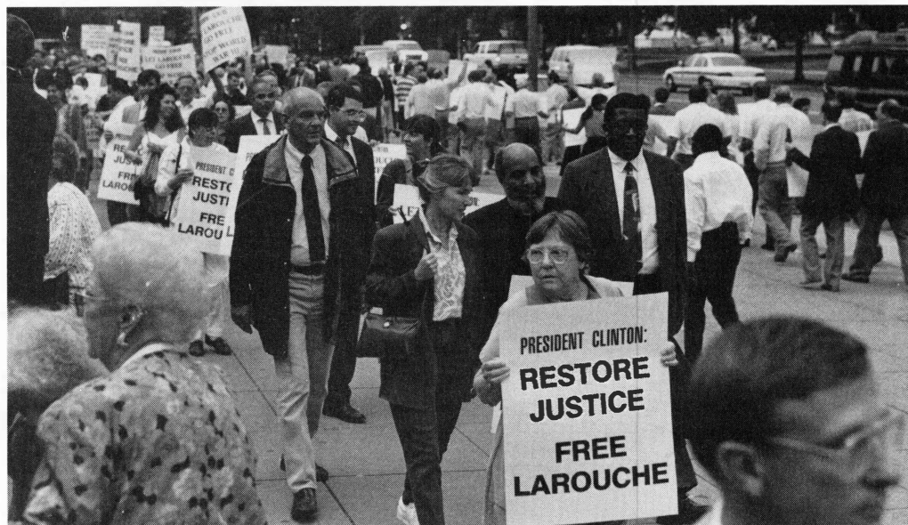
White House protesters tell President Clinton: "Free LaRouche!"

The challenge before the conference, as outlined in the keynote presentation by Helga Zepp-LaRouche, Chairman of