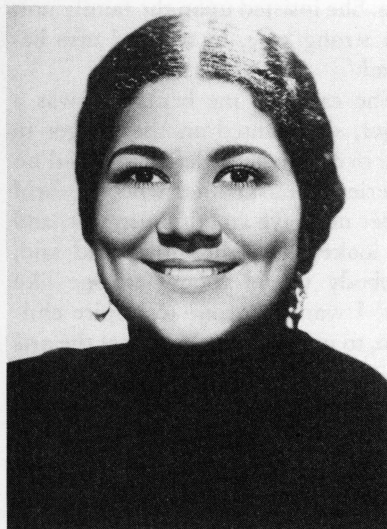
Above: Dorothy Maynor. Below: Outside the Harlem School of the Arts.