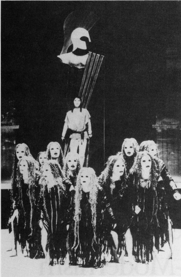
Nobby Clark/Channel 4 International