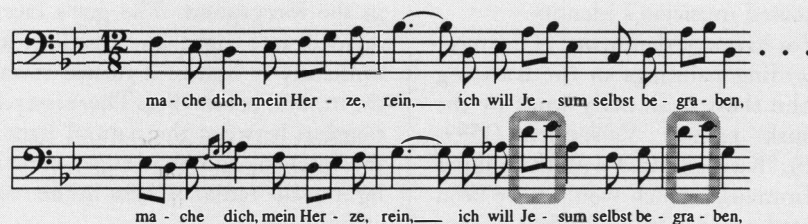
FIGURE 1. Aria "Mache Dich," opening. The grey boxes show where the voice rises into the highest register when singing of Jesus.