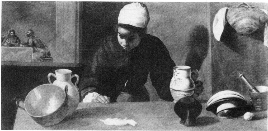
Diego de Silva Velázquez, "Kitchen Maid with the Supper at Emmaus," 1618/19.

Several works are by Renaissance artists who specialized in portraiture, such as the quietly moving "Portrait of a Widower with His Two Children" by G.B. Moroni, painted around 1565. The comparison to the pompous superficiality of many of the eighteenth century portraits is telling—like the Irish aristocrats who blended into the British establishment, such as the fatuous "Earl of Bellamont" painted by Sir Joshua Reynolds in a tall plumed hat and pink satin cloak in 1773.