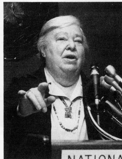
Gov. Dixie Lee Ray

The strongest intervention against the anti-scientific atmosphere dominating the conference was made June 6, at a press conference called by 21st Century